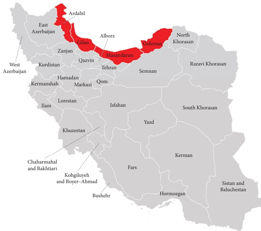
FIGURE 1: Investigated provinces in this research. The red parts are regions that were under observation, and samples were collected.

rabies were confirmed as positive. Among these, the cow's brain tissue samples had the highest percentage, followed by dogs with 34 specimens, and the lowest proportion belonged to the horses, foxes, and camels with only one sample (Table 1). Jackals, wolves, foxes, horses, and camels had the most positive rabies rate in terms of animal species as 100% of the samples from these animals were positive.