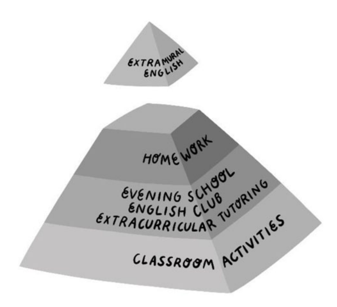
Figure 1. The L2 English learning pyramid (based on Sundqvist & Sylvén, 2016, p. 222).

The structural change can be illustrated with the help of the L2 English language learning pyramid that was originally introduced in Sundqvist and Sylvén (2016, see Figure 1), here revised and split into two L2 English learning pyramids, one for high EE users and one for low EE users (see Figure 2).