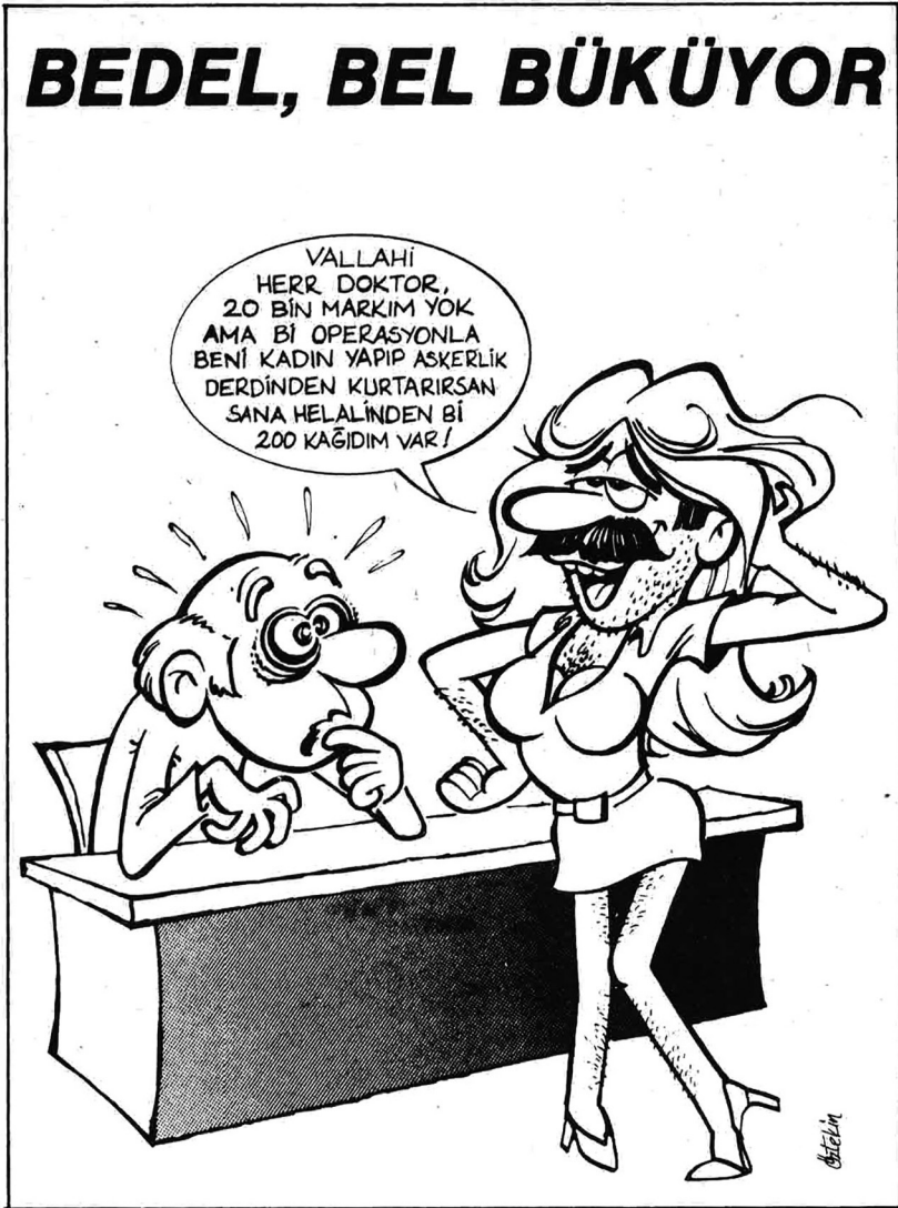
FIGURE 3.5 FEBAG activists published a humorous cartoon in their newsletter, conveying the desperation that young migrants felt when trying to pay their way out of military service, 1984. The caption reads: “By God, Herr Doctor, I don’t have 20,000 marks, but I do have 200 bucks for you if you’ll do an operation to make me a woman and save me from military service.”