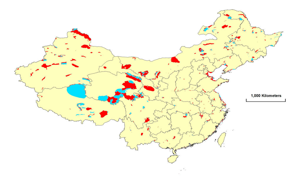
Figure 2. Map showing the extent of the areas of sites of waterbird conservation significance in mainland China that fall outside the current national nature reserve coverage, updated as of 2008. Areas in light blue represent the sites of waterbird conservation significance that fall under the protection of national nature reserves and those areas marked in red represent the area of sites of waterbird conservation significance that fall outside of existing national nature reserves.

network for waterbirds in western China are also considerable since a larger number of sites of conservation significance were identified in western provinces than in eastern provinces (Table 2). Although the area of newly identified sites is small (constituting 5.3% of the total area of all sites of waterbird conservation significance), these new sites constitute almost a third of the number of all sites. We believe that the benefit from improved survey efforts and enhanced knowledge of habitats has been more effective in delineating site boundaries and will better focus future conservation efforts.