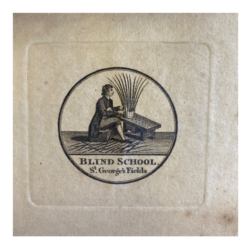
Figure 3—Annual report of the School for the Indigent Blind... (1805), Surrey History Centre, 9543/2/1. Reproduced by permission of Surrey History Centre. Nearly identical engravings were used by the Bristol institution in its reports, and on the Norwich Institution's posters related to its music festivals.

attitude: "I cannot but remind you, what little regard you have for the situation you are so happily placed in, and to those friends who obtained it for you." Robert had been expected to "study to gain a good name and to have shown your gratitude to the committee by such conduct" and to leave with a good character.<sup>101</sup> Such disciplinary cases reveal the institution's belief that its mission was to produce not only capable workers, but also pupils who had internalized the industrious and docile character that the committee hoped would ensure social integration when they left.