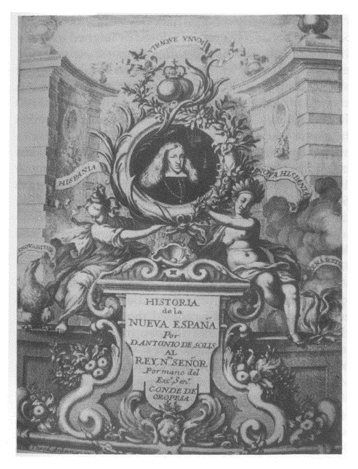
Figure 1 Frontispiece, Antonio de Solís, Historia de la conquista de México, población, y progressos de la América septentrional conocida por el nombre de Nueva España ( Madrid, 1684 ).

obligatory genuflections to rulers, patrons, and censors, however, and they are as characteristic of unofficial or noncommissioned—published and unpublished—histories as they are of official ones. Indeed, it is probable that most such books of kings were not read or commissioned by kings, princes, or their courts but instead sponsored by councils, academies, or circles of the lettered.<sup>1</sup> What can we learn from the royal earwax? Did it perhaps rub off on histories themselves?