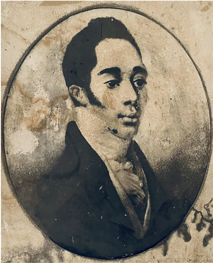
Figure 1. James Samuel Bannerman (May 6, 1790–April 23, 1858).

and equipped at his own expense” at a cost of £5,000. According to Pine, Bannerman was only given a paltry compensation of £500 “many years later” as a “cost of compromise” instead of the actual amount he had stated. A sympathetic Pine had to reiterate that he had no doubt Bannerman’s financial claims were accurate. 3