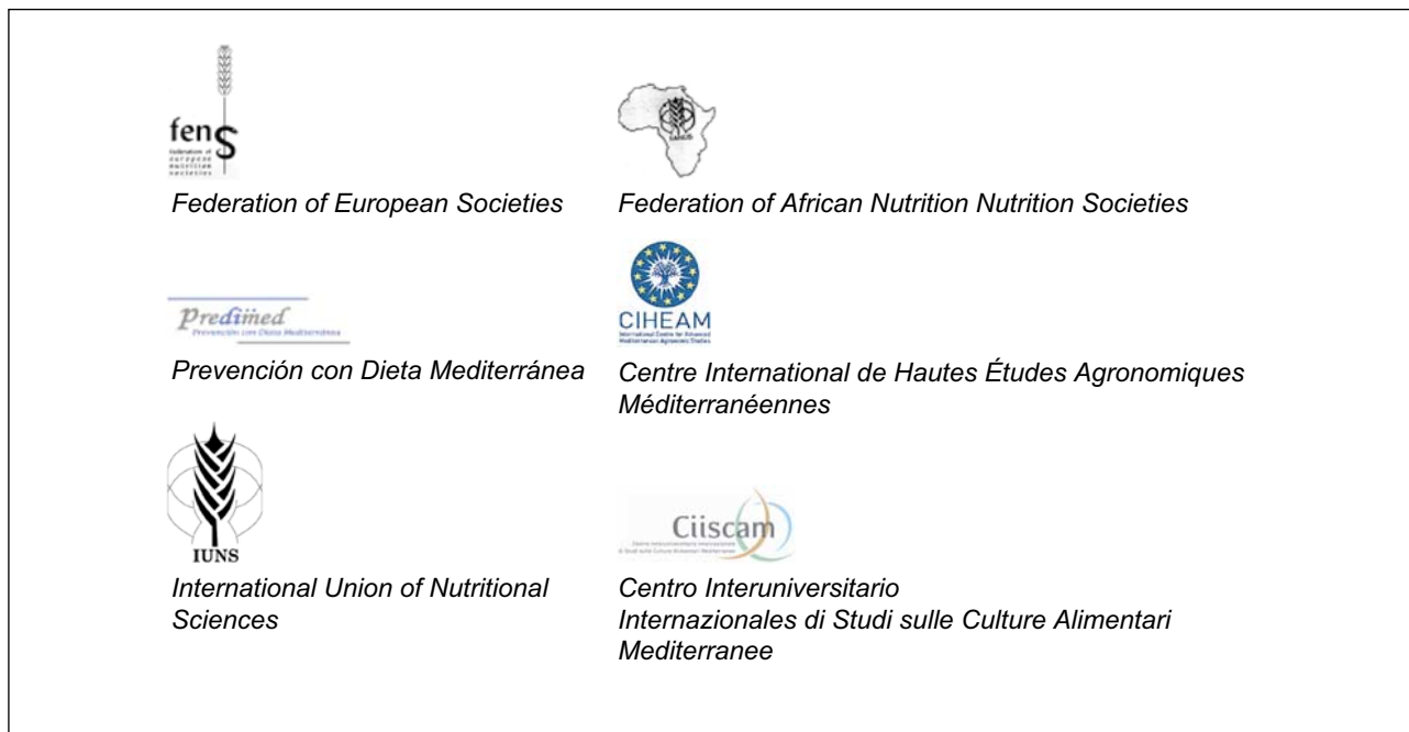
Fig. 3 (Continued)

although needs may vary among people due to age, physical activity, personal circumstances and weather conditions. It should be consumed freely, bottled or from the tap, when hygienic circumstances allow it. In addition to water, sugar-free herbal infusions and tea, and low-sodium and low-fat broths may help to complete the requirements.