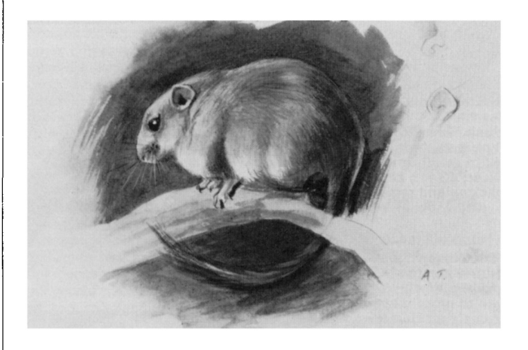
'Study of a Dormouse'