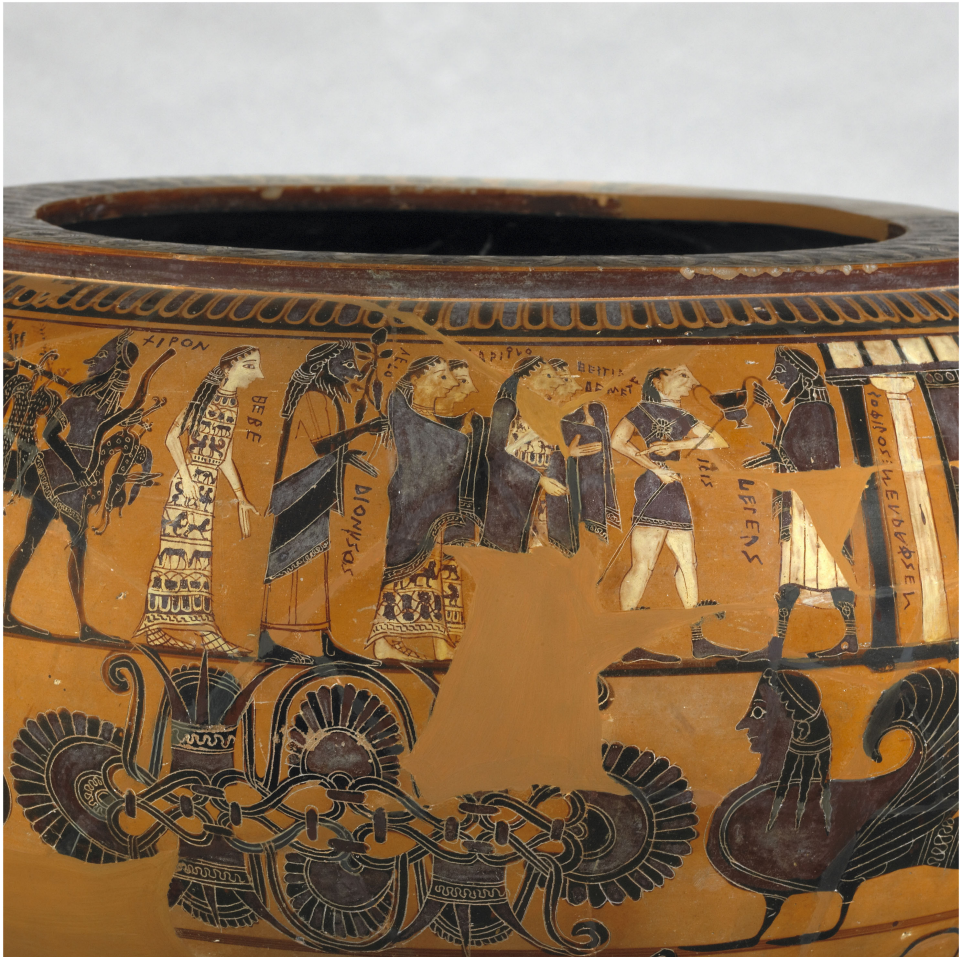
Fig. 1. Anthropomorphic Hestia on the Sophilos dinos. British Museum 1971, I 101.1.