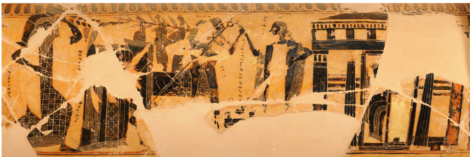
Fig. 2. Anthropomorphic Hestia on the François vase. Florence, Museo Archeologico, 4209.