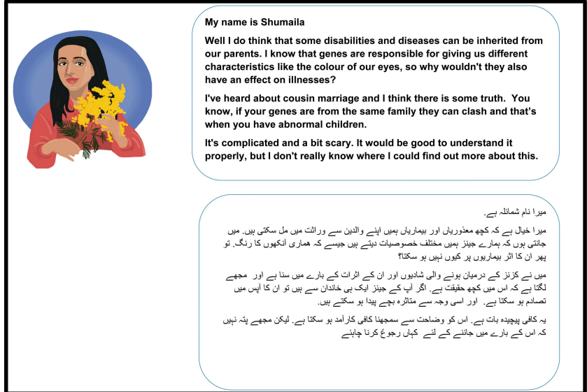
Figure 2 Contrasting personas

Two workshops (one mixed sex and one single sex) were conducted. Each workshop was attended by 14–16 participants. The objective of these workshops was to obtain detailed feedback on the prototype resources in relation to their tone, adequacy, readability/comprehensibility, believability and acceptability. The research team and participants critically reviewed the leaflet line by line and