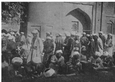
8. In a Market Place at Bokhara.