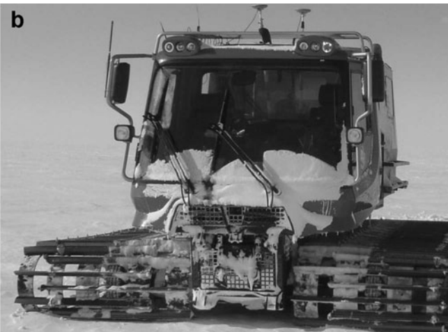
Fig. 1. (a) The reference GPS station at the base camp. The green cabin is the living quarters, the GPS antenna is installed on a tripod and the radio antenna is on the top of the cabin. (b) The dual roving GPS receivers mounted on the Pisten Bully 300 over-snow vehicle. The two antennas are on top of the vehicle and the radio antenna is on the top-left side of the cab.