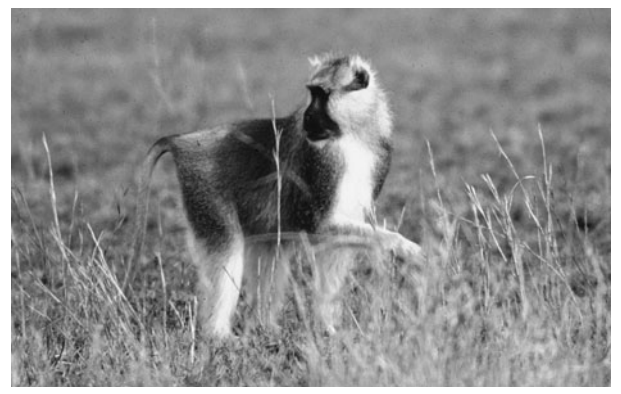
PLATE 1 Adult male southern patas monkey E. p. baumstarki in the Northern Extension of the Serengeti National Park, Tanzania.

(567 km<sup>2</sup>). This area was chosen for survey based on reports by R. Radke (pers. comm.) in 1998 of patas in the western Serengeti. The vegetation in the western Serengeti includes open grassland plains, medium-dense Acacia/Balanites woodland-bushland, and riverine forest along the Grumeti River. Three rivers (Grumeti, Momukomule and Rubana) provide water to the area (Fig. 1). Even during the driest periods these rivers usually provide widely scattered pools of water. The Rubana River, along the western boundary of the Nyakitono Open Area (Fig. 2), is considered the most important wildlife water source in the area. One water trough in this area serves as a permanent water source for wildlife.