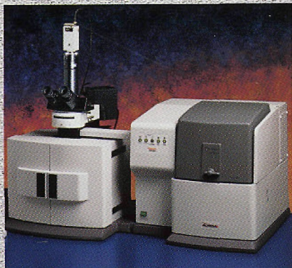
Almega™ Dispersive Raman System