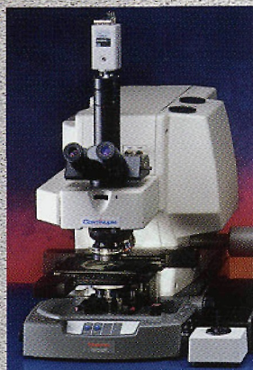
Continuum™ IR Microscope