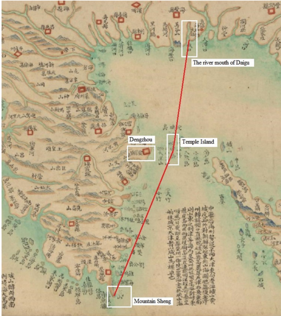
Figure 6. (Colour online) Patrol Limit of the Dengzhou Navy (Map: Qisheng yanhaitu ; the 1880s edition)

by the Chinese Academy of Science, where the daoyu tu is now preserved, this coastal map was compiled under official supervision sometime between 1734 and 1842. 52 It depicts the coastal situation of Dengzhou and portrays a series of significant islands off the Shandong coast. The marginalia on the coastal map indicate the time required for the Dengzhou navy to reach those islands. It also shows the patrol limit of the navy. For instance, it mentions that “from Dengzhou to the western part of Bohai the navy must pass by several islands. It