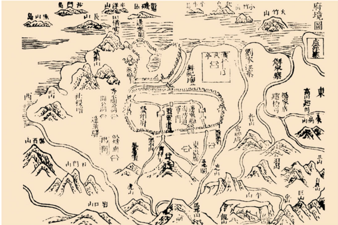
Figure 5. (Colour online) Dengzhou fu jing tu (Shunzhi edition)