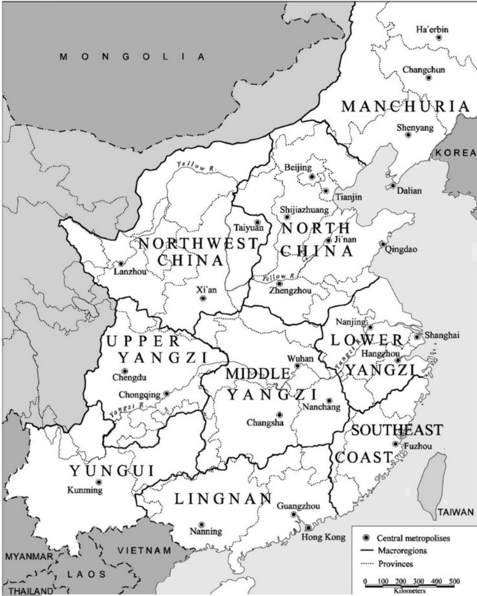
Figure 1. The Skinner Model

(4) the Taiwan Strait, and (5) the Guangdong sea zone. This five-zone model derives from a coastal map ( haitu ) entitled Qisheng yanhai tu (The Coastal Map of Seven Coastal Provinces) officially produced in the late eighteenth century and reprinted subsequently in the nineteenth century. The nineteenth century edition of this coastal map introduces “dividing lines ( fenjie )” between specific maritime spaces (see Figure 2). These dividing lines indicate that specific maritime spaces were policed and governed by their respective