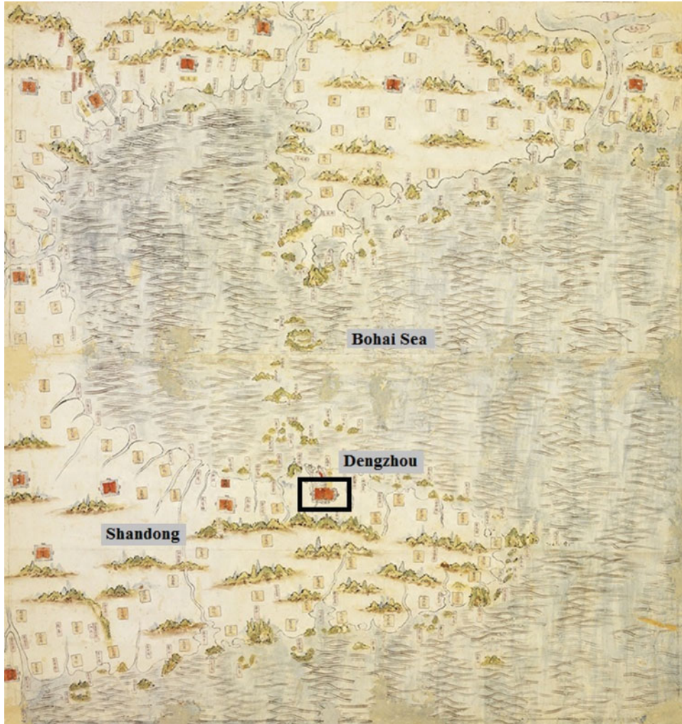
Figure 3. (Colour online) Deng Jin Shan Ning sizhen haitu (Ming edition; National Palace Museum)

Dengzhou as the place that “controls the safety across the Bohai Gulf as well as the Yellow Sea region”. 19