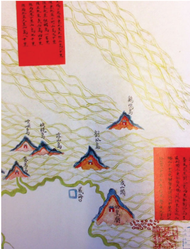
Figure 7. (Colour online) Shandong Dengzhou zhenbiao shuishi qianying beixun haikou daoyu tu

is a 720 li journey. The Daigu estuary marked the limit of the navy's patrol and acted as a dividing line between Shandong's water and Tianjin's water. Once the navy reached the river mouth of Daigu, there would be the patrol limit and the dividing line between Shandong and Tianjin sea spaces".