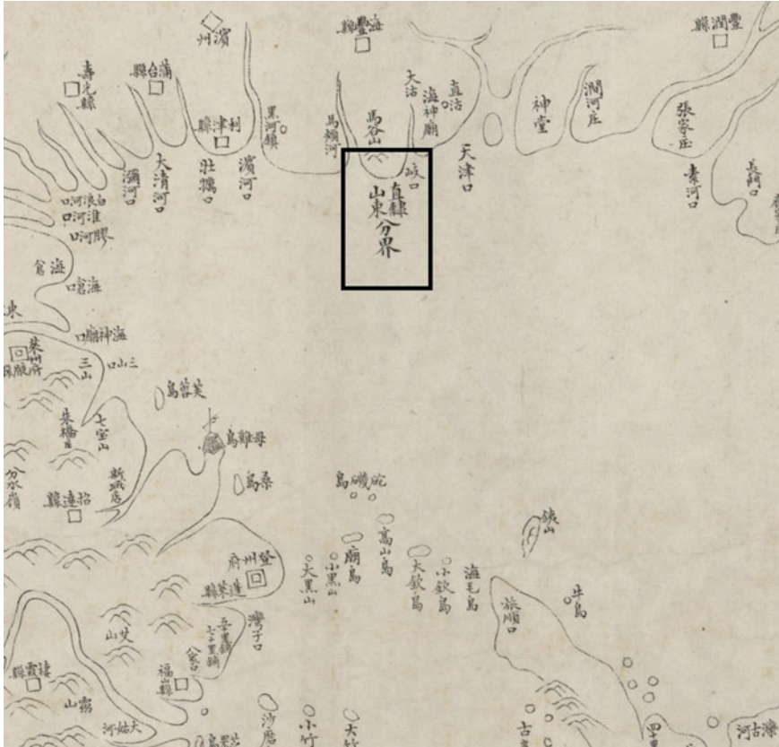
Figure 2. (Colour online) Example of “dividing lines ( fenjie )” (Map: Qisheng yanhai tu ; 19 th century edition)

coastal provinces. Breaking down the maritime frontier of the Qing Empire into the same divisions that were used at that time is perhaps the best way to study the maritime policies, consciousness, and ideologies in question. Understanding the development of coastal China in the late imperial period may also help us escape the Euro-centric framework.