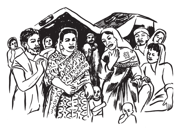
Mental health problems are common: at least two of those people are likely to suffer from a mental health problem at some point in their life.

Even though we talk about the mind and body as if they were separate, in reality they are like two sides of the same coin. They share a great deal with each other, but present a different face to the world around us. If one of the two is affected in any way, then the other will almost certainly also be affected. Just because we think about the mind and body separately, it does not mean that they are independent of each other.