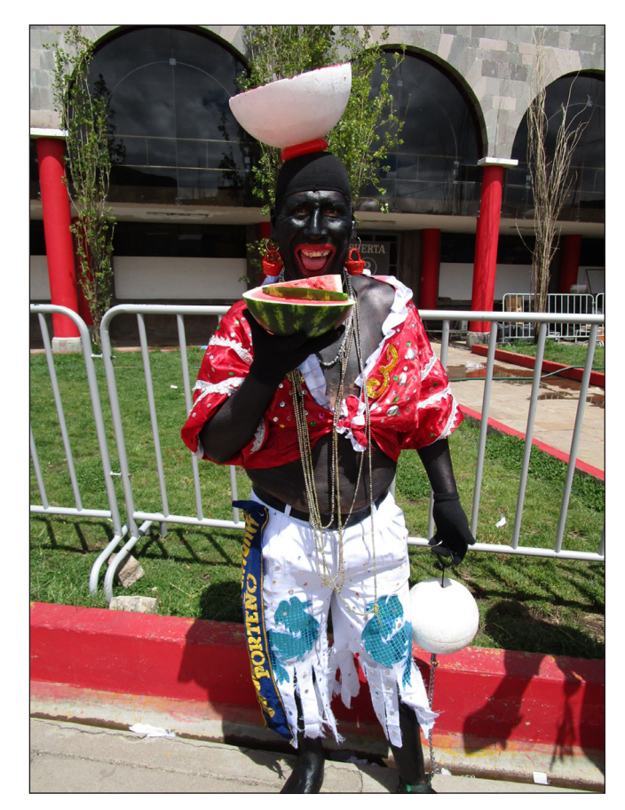
Figure 4: Sambos' Watermelon Man at La Fiesta de la Virgen de la Candelaria, 2018.

to briefly incorporate a black mask in theatrical scenes of their performances.<sup>4</sup> The directors of Sambos Illimani explained to me that the Fiesta de la Virgen de la Candelaria is only one of two special occasions of their yearly performance calendar in which they don blackface.<sup>5</sup> While all neo-folkloric dances draw from transnational repertoires of representation, I find Sambos' performance to be so compelling because it references multiple genealogies of blackface from the Americas simultaneously.