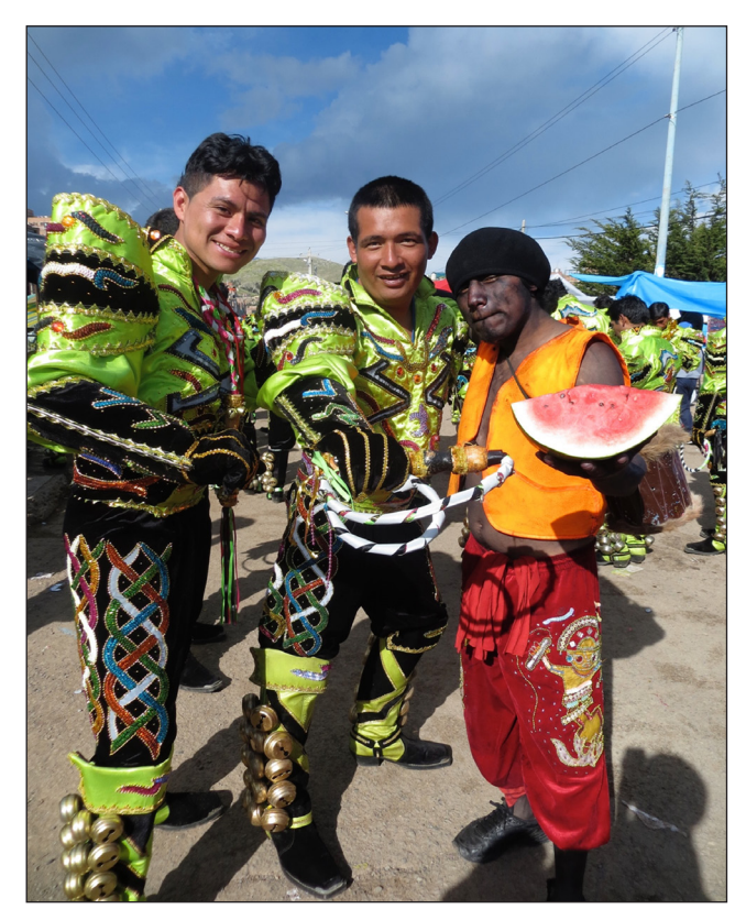
Figure 1: Caporales and one of the blackface dancers from the performance troupe Sambos Illimani con Sentimiento y Devoción. Taken by the author at La Fiesta de la Virgen de la Candelaria in 2013.