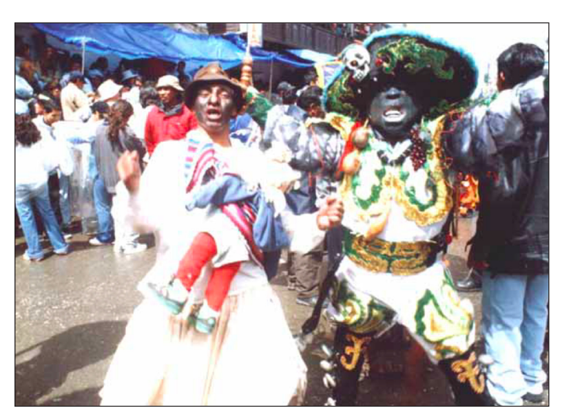
Figure 6: Male cross-dressed as a black woman with her baby, and a performer wearing a costume mixing the caporal boots with the tropical images from the negrito dance. The photograph was taken at Bolivia's Carnival de Oruro in 2003.