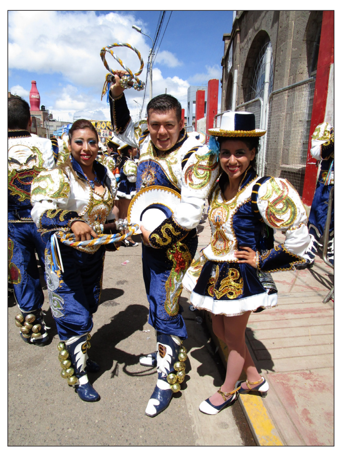
Figure 2: Caporal, Caporala, and La Machita of Sambos Illimani. Taken by the author at La Fiesta de la Virgen de la Candelaria in 2018.

Figure 1: Caporales and one of the blackface dancers from the performance troupe Sambos Illimani con Sentimiento y Devoción. Taken by the author at La Fiesta de la Virgen de la Candelaria in 2013.