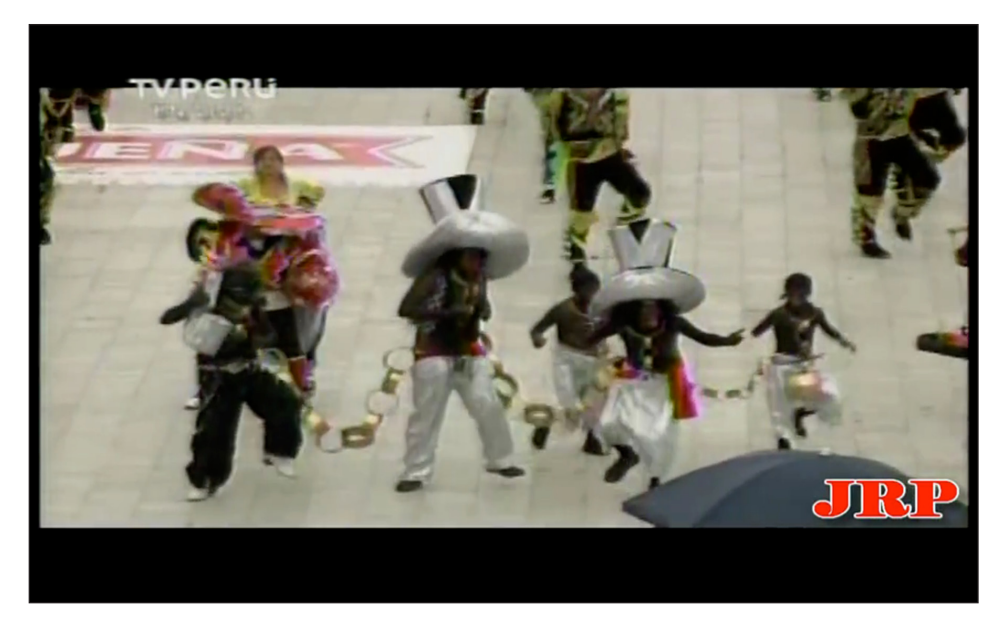
Figure 3: Still of Sambos' performers dressed in blackface and chained together. From "Caporales con Sentimiento y Devoción 2013," YouTube video, 7:07, posted by "MycandelariaPuno," March 3, 2013, https://www.youtube.com/watch?v=5qjYIuRErSg.

the master or slave driver and the slaves. The blackface figures alongside the racially ambiguous Sambos performers create a juxtaposition between an identifiable blackness and the racially ambiguous bodies that stand in for whiteness, blackness, indigeneity, and racial mixture all at once. Suddenly, the drums start beating faster, trumpets blare, and the cry of "Zambo" shakes the entire stadium. A thousand dancing bodies come to life and the fiesta is alive.