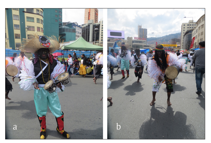
Figure 5a and b: Members of the Fraternidad Saya Negritos de Ayacucho performing at La Fiesta de Gran Poder in 2017. This is a modern derivative of the Tundique dance. These images capture the Afro-Cuban influence as the grapes dangle from one performer's ear, and the sleeves of their shirts have large ruffles associated with Cuban mambo.

tell the story of a negra zamba (black woman) dancing the Saya de Tundiqui with her baby and who receives a little bird from Saint Benedict for the Fiesta de los Negritos. While the song conflates the Afro-Bolivian Saya with the Tundique, it maintained the dance's association with representations of blackness from Catholic religious rites. The song became a local and international hit at the height of the New Song Movement in Latin America.<sup>17</sup> Los Jairas toured with the movement's founder, Violeta Parra, and they successfully catapulted the Tundique rhythm and the Pan-Andean sound into the commercial world (Cunningham 2011). They exported the Tundique beat from Bolivia to other parts of the hemisphere. The song "San Benito" was soon covered by other groups in the region, most notably the Chilean folkloric group Inti-Illimani, and it became a hit in Bolivian street carnivals. Local Bolivian groups including the Banda Pagador de Oruru often covered "San Benito" at the carnival in Oruro in the 1960s. The Estrada family, who would be inventors of the Danza de Caporales, claim to have been inspired by the band's performance (Sánchez-Patsy 2006). They would use the Tundique beat as the foundational rhythm of a new dance called the Danza de Caporales.