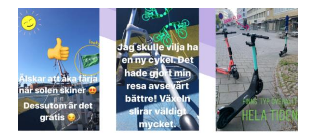
Figure 2. Creative voice application. Left: digital collage on Mural (group 9). Right: generative techniques with Instagram (group 3).