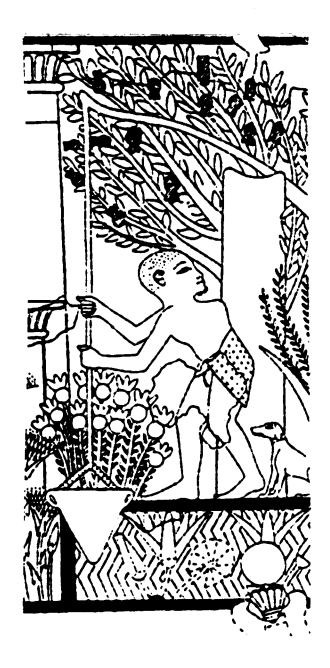
Figure 2. The Tomb of Ipy: hump-backed gardener operating a shaduf. From Davies, op. cit., note 41 above.

The hump-backed gardener operating a shaduf in the tomb of Ipy (fig. 2)<sup>52</sup> may be shown with a bursa or scoliosis which could perhaps be related to a secondary infection aggravating the repeated strain of operating the counterweighted water-lifting sweep to irrigate the