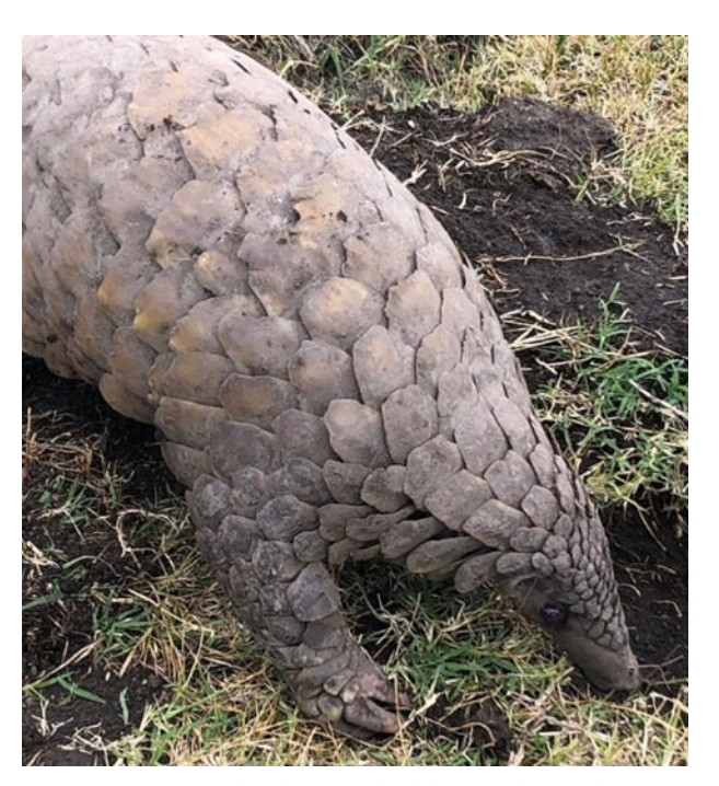
PLATE 3 Giant pangolin photographed during release after becoming trapped under an electrified fence. Photo was taken on the edge of the savannah–Afromontane belt in western Kenya, in August 2018.

A third record was reported in August 2018, c. 4 km west of the second sighting. A pangolin that had become trapped under an electrified fence was removed and relocated to a nearby forest. Videos and photographs were used to identify the animal based on its size, relative tail length, forelimb definition and movement suggesting the animal to be