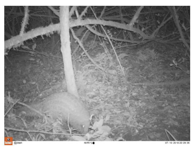
PLATE 1 Giant pangolin Smutsia gigantea photo-trapped in an Afromontane forest in western Kenya, on 19 July 2018 at 22.28.

a camera-trap survey conducted in July 2018 in a primary highland forest in Kenya's Rift Valley region, in which a giant pangolin was captured in a single event (Plate 1). The presence of the giant pangolin in this location potentially makes it sympatric with Temminck's pangolin, a species with which the giant pangolin can be confused because of their morphological similarities (Hoffmann et al., 2020). Although the area where the image was captured is within the defined range of Temminck's pangolin (Pietersen et al., 2019), to our knowledge there are no confirmed records of Temminck's pangolin from this area nor from rainforest habitats anywhere across its range. Confirmation of this record being a giant pangolin is based upon the habitat type and several physical characteristics: Temminck's pangolin is considerably smaller than the giant pangolin (up to 140 cm in total length and weighs up to 21 kg; Pietersen et al., 2019), and a blue duiker Philantomba monticola