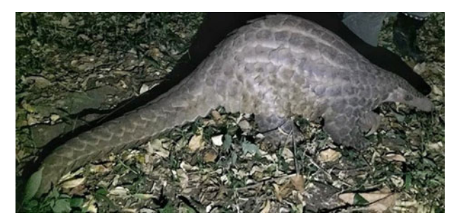
PLATE 2 Giant pangolin photographed by the side of the road on the edge of the savannah–Afromontane belt in western Kenya, in July 2018.

captured in the same position on the same camera (head and body length 55–90 cm and shoulder height 32–41 cm; Kingdon et al., 2013) provided a size reference. The pangolin recorded here is estimated to be at least 140 cm in length, with the girth, tail length, elongated head and body shape indicative of a giant pangolin. The front legs are relatively long and robust, suggesting the quadrupedal locomotion characteristic of the giant pangolin rather than the bipedal locomotion of Temminck's pangolin, and the scale shape and rows are more consistent with those of the giant pangolin, having a greater number of more rounded scales relative to overall size (Hoffmann et al., 2020).