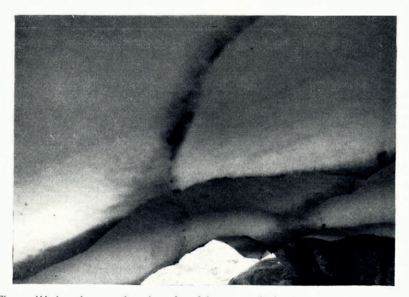
Fig. 4. Ablation polygons on the under-surface of the snow-patch, showing edges darkened by melting