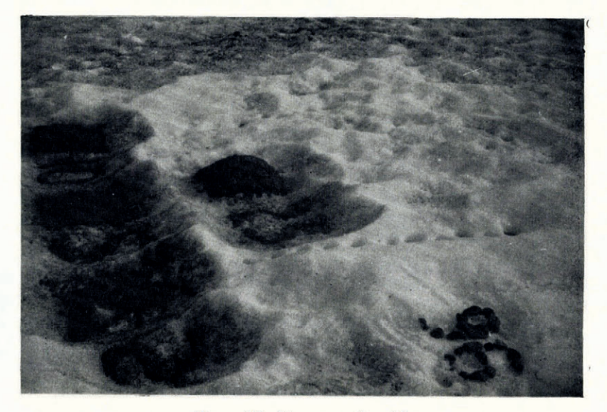
Fig. 7. The dirt squares after 96 hr.