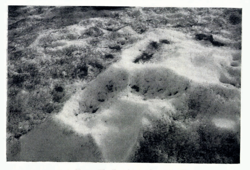
Fig. 11. The dirt-strip area after 96 hr.

(b) Under the influence of warm sunny weather, hollows are melted in the snow surface and particularly beneath thin accumulations of dirt which tend to be dispersed in the hollows. Under the later influence of strong winds, the material dispersed at the bottoms of hollows would tend to be concentrated again at right angles to the wind direction, and either blown on to the ridges or be so undercut that hollows form on the windward side. This would result in a sharp-edged pattern, in distinction to the