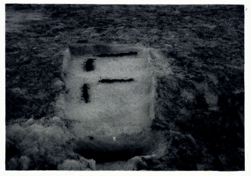
Fig. 8. The dirt strips as laid down

At the end of the first 24-hr. period, during which time scoops had been cut on all but the leeward sides of the two more thickly covered dirt squares, changes were also noted in the immediate vicinity of the four strips (Fig. 9). The thicker of the two strips which lay parallel to the down-valley wind direction (furthest from the camera in Fig. 9), was raised slightly, whilst the thinner one which lay in the same direction was definitely lowered. Each of the two strips which lay at right angles to the wind direction had developed a scoop on its up-wind side. The trench containing the stones had been opened out and its edges sharpened, whilst its sides, which had hitherto been smooth, were now interrupted by the development of ablation polygons (Richardson and Harper, 1957). Dirt had collected both on the ridges between