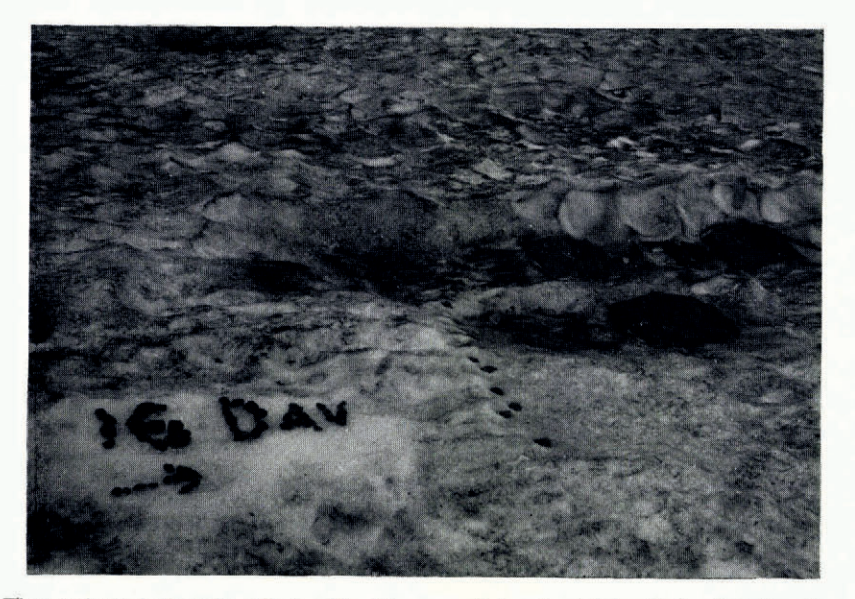
Fig. 3. The experimental site on the 16th day. The dirt squares lie in a trench below the heavily patterned snow surface

Sections were cut through several cones, and in each case the material was found to consist of hard-packed and slightly granular snow (Fig. 2). It seems certain that any summer