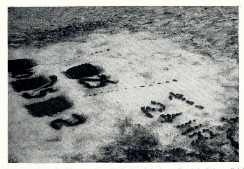
Fig. 5. The dirt squares after 24 hr. The arrow shows the direction of the down-valley wind which prevailed throughout this period

During the first four days these squares were inspected in detail and photographed at 24-hr. intervals. No observations were possible on days five to seven inclusive owing to the absence of the glaciologists who were then at work elsewhere. During days eight to ten, a blizzard entirely buried the experimental squares with snow, but after this had melted sufficiently by day twelve, further observations were made until day eighteen.