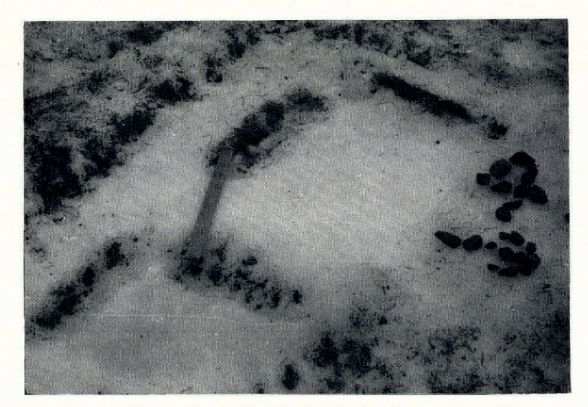
Fig. 10. The dirt-strip area after 48 hr.