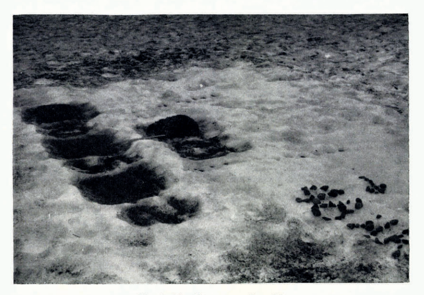
Fig. 6. The dirt squares after 48 hr.

During the succeeding three days there were long periods of sunshine with virtually no wind. Temperatures were high and humidities low, and under the influence of these changed meteorological conditions the embryo features on the experimental plot were affected by different processes. After the lapse of 48 hr., the pebbles arranged parallel to two sides of the 25 mm. square had begun to sink into the snow surface (Fig. 6) instead of lying on the surface