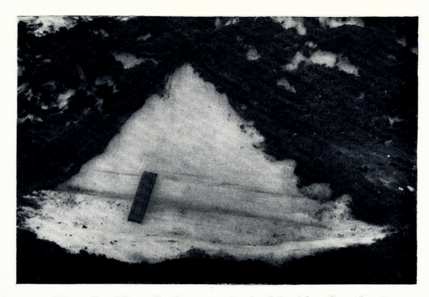
Fig. 2. One of the smaller dirt cones, sectioned and viewed from the south-east