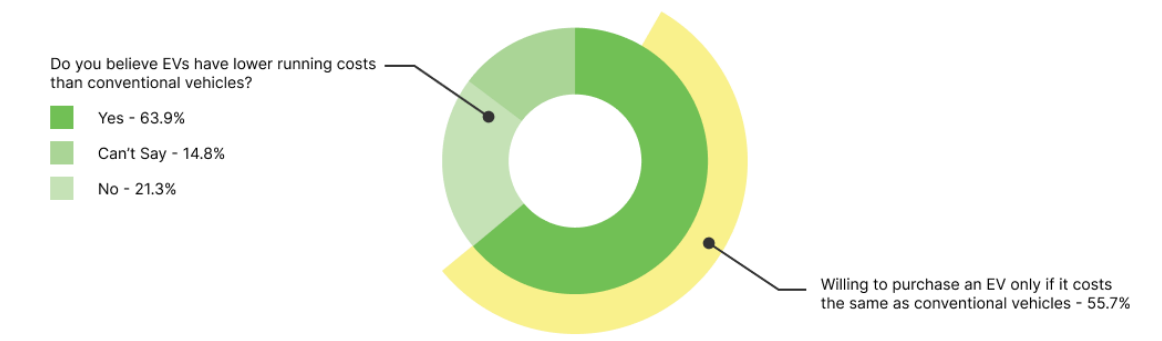
Figure 2. Survey data highlighting insights regarding the perception of running costs and upfront costs of EVs

More than half of the sample population would potentially purchase an EV only if it costs the same as ICE vehicles (Fig 2). However, they felt EVs are low-cost and money-saving on running expenses, indicating that the high upfront costs are a major concern and inhibitor of EV adoption for rural consumers. Hence, OEMS must reduce the upfront costs of EVs, which, along with low operational costs, can be a strong incentive to promote the adoption of EVs in rural areas.