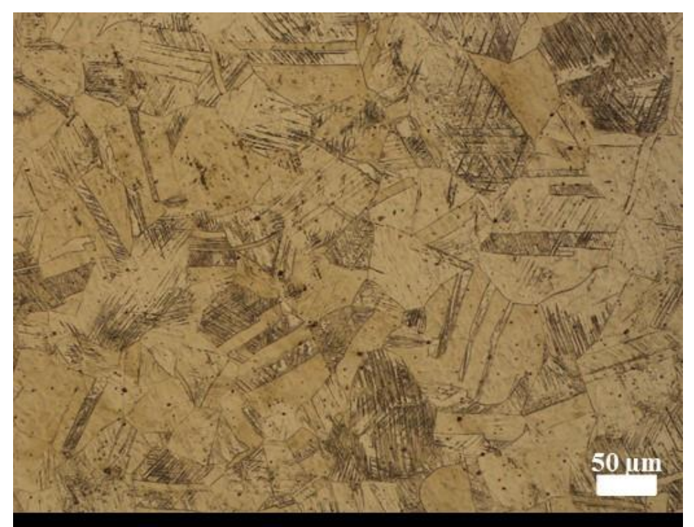
Figure 1. Bright field of optical micrographs at 200x magnification in the AISI 304 stainless steel using "aqua regia" (HNO3+HCl) as the chemical etching.

hand, it was possible to reveal the microstructure with good quality resolution in the AISI 304 stainless steel, making use of the combination between "aqua regia" and "potassium metabisulfite" [5].