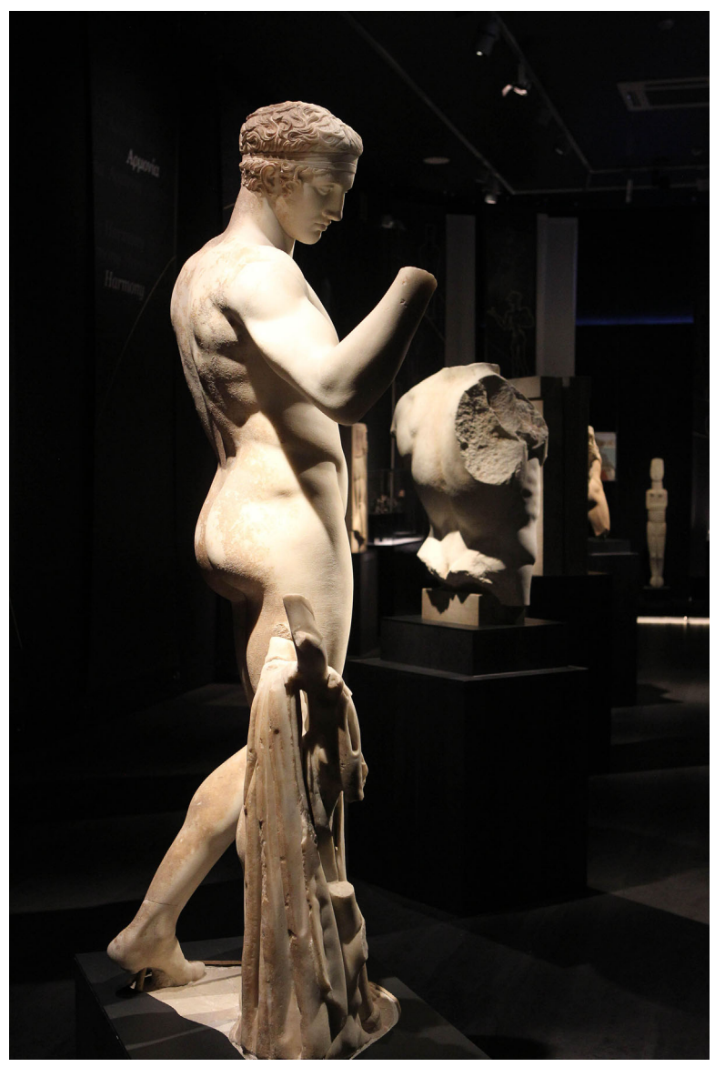
8.1. Diadoumenos on display, Countless Aspects of Beauty in Ancient Art exhibition at the National Archaeological Museum of Athens, 2018.