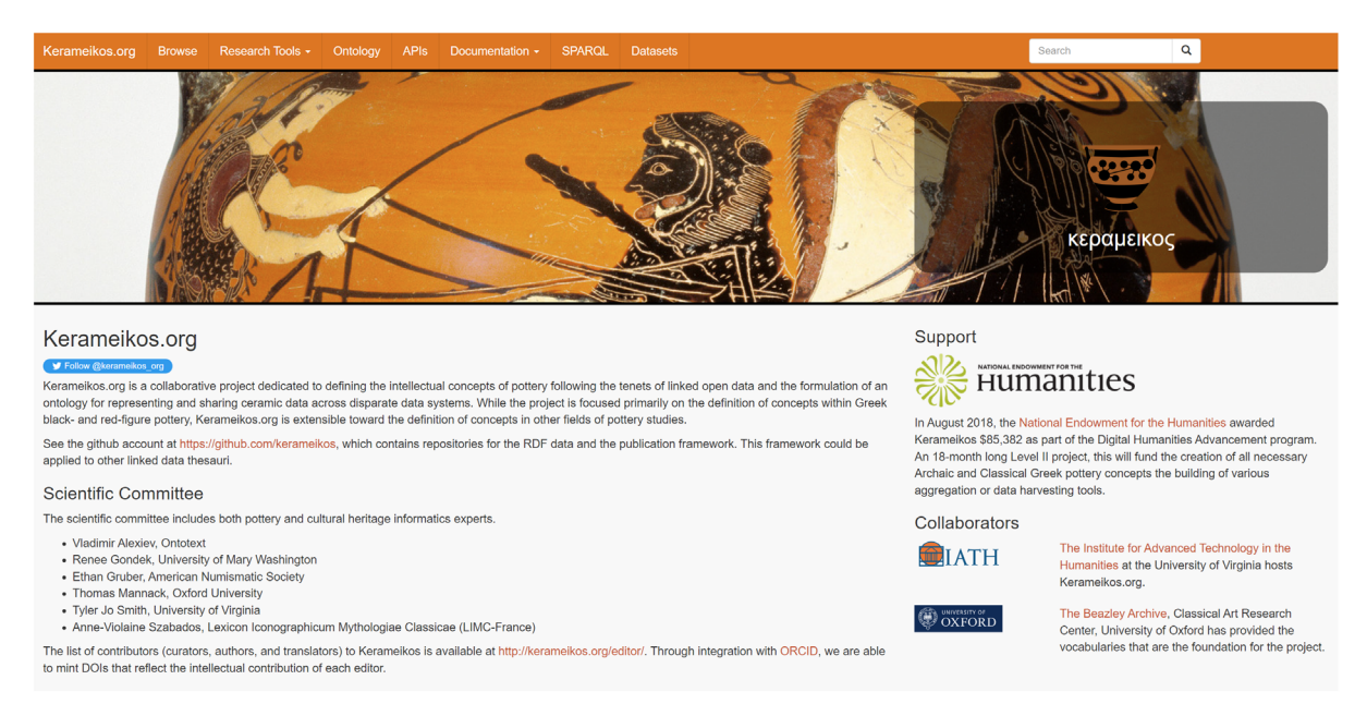
8.3. Kerameikos.org website, detail of homepage.