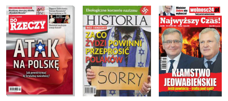
Figure 2. Covers of right-wing Polish magazines issued during the debate of the Polish Holocaust Law in late February 2018. (Left) The weekly Do Rzeczy (no. 9) diagnosed an 'Attack on Poland' and asked 'How to stop this brutal storm?' (Centre) The monthly Historia bez cenzury (no. 3) focused on 'What should the Jews apologize to the Poles for'. (Right) The weekly Najwyższy Czas! (no. 9) featured the former Polish presidents Bronisław Komorowski and Aleksander Kwaśniewski against the background of a barn on fire asking 'The Jedwabne lie – will they be charged if they do it again?'

who had managed to survive the deadliest phase of the Holocaust were denounced or killed by their Christian neighbours (Engelking and Grabowski 2018, 21–22, 29–37). Extended to the entire country, these findings from nine Polish districts would mean that Poles were responsible for the death of approximately 200,000 Jews. In other words, as Jan T. Gross provocatively stated, during the Second World War Poles killed more Jews than they killed Germans (Gross 2018, 194–196). Was it a coincidence that the Polish Holocaust Law was passed a couple of weeks before the public release of Night without an End ?