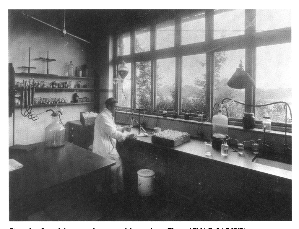
Figure 3. One of the serum department laboratories at Elstree (CMAC: SA/LIS/R).