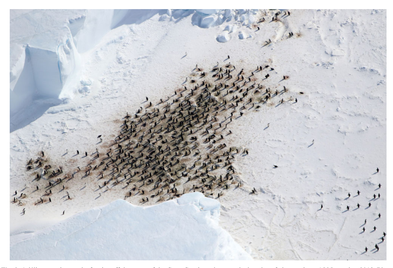
Fig. 3. Adélie penguins on the fast ice off the coast of the Cape Crozier colony on the last day of observations, 15 November 2018.

f9bf0107-d6df-4f30-9479-36c76b23969e-inv). However, there was a storm on 3 December, and it seems that the colony was lost. The fate of the individual birds is not known; the fast ice was effectively gone by 4 December and remained that way through 12 December as confirmed by VHR (catalogue ID: 1040010045C93C00) and 19 December, as confirmed by helicopter. Thus, this satellite sub-colony existed for at least one month in spring 2018.