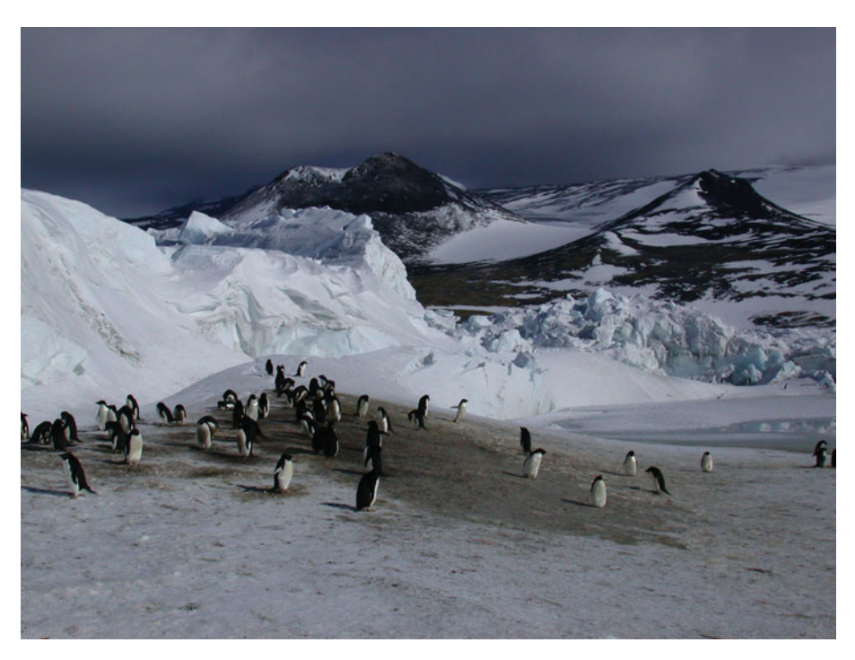
Fig. 4. Adélie penguins on the fast ice close to the Cape Crozier colony in spring 2002. Note the lack of evenly spaced nests and the high proportion of loafing penguins.

enigmatic atmospheric or climate changes, it is imperative that it is documented; broadly speaking, there is a need to identify which species will respond, adapt or display plastic behaviour and which species will fail with respect to our changing climate (Pettorelli 2012).