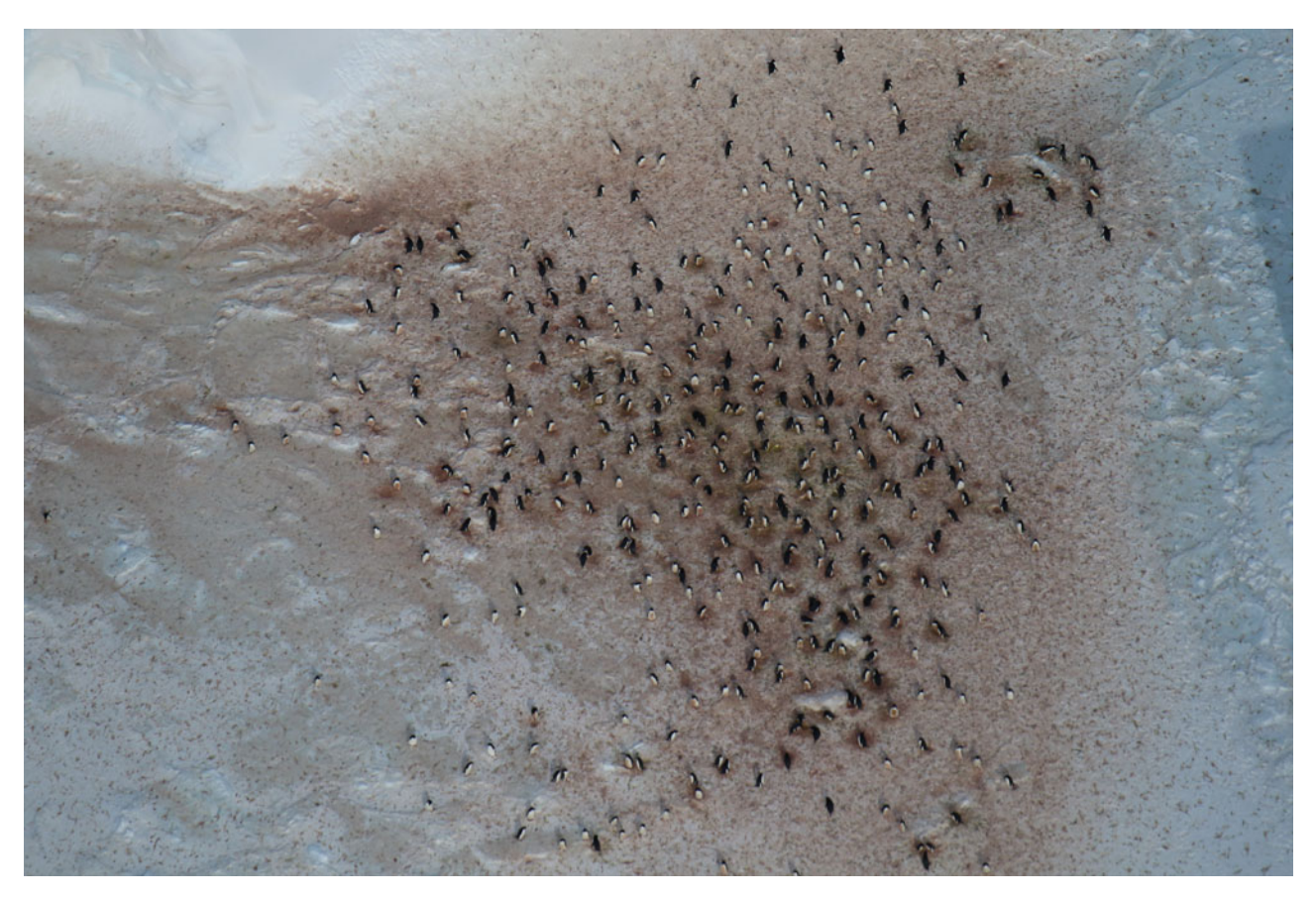
Fig. 2. Adélie penguins apparently 'nesting' on the fast ice off the coast of the Cape Crozier colony on 9 November 2018, the date of initial discovery. Photo credit: Sara Labrousse, with a 400 mm zoom lens.

recorded elsewhere in the Ross Sea (e.g. Cape Colbeck; LaRue et al. 2014a), a group of Adélie penguins were found. The birds were photographed using 400 mm telephoto lenses at this location on three occasions (9, 13 and 15 November 2018), as well as the surrounding landscape, and subsequently counted the number of individuals on the photographs from 9 November. We then reviewed VHR (via DigitalGlobe, Inc.) to determine whether the guano stain was detectable from the images and to verify the location and timing of arrival.