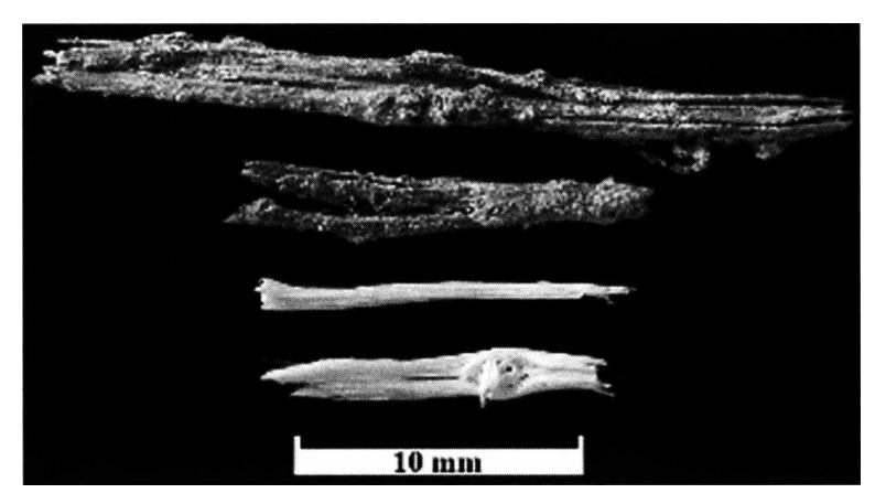
Figure 2 Photograph of plant fragments from the Diprotodon gut contents: upper 2 samples untreated, lower 2 samples after overnight soaking in alkaline hypochlorite bleach.

in Figure 2 shows untreated fragments of the gut contents, and others after soaking overnight with 20% sodium hypochlorite in 0.05M NaOH. In the course of this work, we explored simpler alternatives to the standard \alpha -cellulose extraction, and the extent to which different stages of the procedure remove contamination.