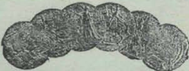
Gold Medal Allahabad 1910.

Paris 1900, Brussels 1910, Buenos Aires 1910.