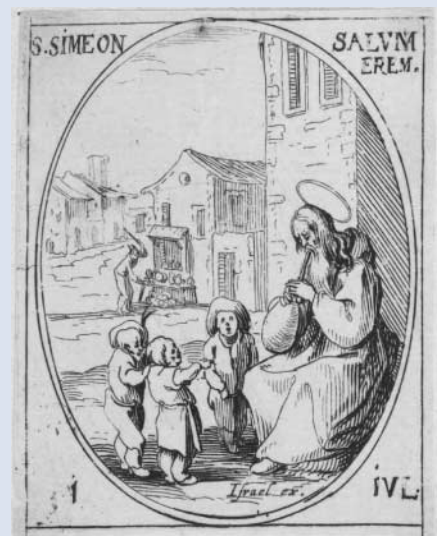
Jacques Callot, Saint Simeon Salus, 17th century.

The life of Symeon contains common features with traditional hagiographical literature with the purpose of showing that the saint was an imitator of Christ. Thus, Symeon gives food to the poor, practises exorcisms and saves people from sins. Nonetheless, he had erratic behaviours unparalleled in other anchorites that constantly provoked public scandals: he ate copiously in taverns, defecated in the streets, practised nudism, entered the baths of women, pretended to rape a woman and walked around being carried and whipped by prostitutes in a sadomasochistic manner. The behaviours described in the life of Symeon could be compatible with severe mental illness, but his reputation made him turn the patron of the mentally ill, whose festivity is celebrated on 1 July. Probably due to the eccentricity of Symeon Salus, there is not an iconographical tradition of him and therefore no devotional images. Calendars are probably the only visual source for Symeon Salus. A 17th-century French calendar illustrates the festivity of 1 July with a beautiful etching by the artist Jacques Callot that lyrically depicts Symeon in the city of Emesa surrounded by children.