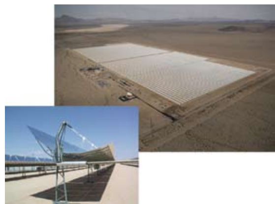
Figure 1. Aerial photograph of Acciona’s Nevada Solar One, a 64 MW parabolic trough power plant near Las Vegas, Nevada, that covers 280 acres. Inset: Closeup of an individual parabolic trough unit at Kramer Junction, California, showing the curved mirror and the receiver.

Parabolic trough systems concentrate the sun’s energy through long, rectangular, curved mirrors (see Figure 1 ). The mirrors are tilted toward the sun, focusing sunlight on a receiver,