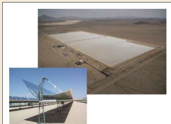
Figure 1. Aerial photograph of Acciona’s Nevada Solar One, a 64 MW parabolic trough power plant near Las Vegas, Nevada, that covers 280 acres. Inset: Closeup of an individual parabolic trough unit at Kramer Junction, California, showing the curved mirror and the receiver.

Parabolic trough systems concentrate the sun’s energy through long, rectangular, curved mirrors (see Figure 1 ). The mirrors are tilted toward the sun, focusing sunlight on a receiver,