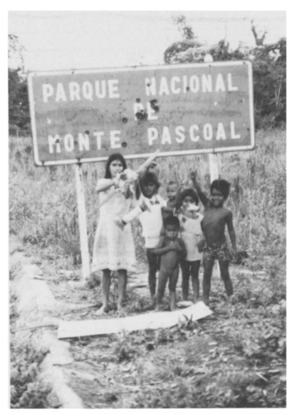
Entrance to the park with Pataxo Indians selling artefacts.

In fact, the park is providing little protection for its 34