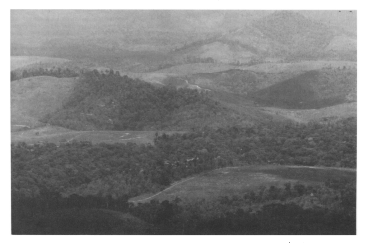
Forest clearing surrounding Monte Pascoal National Park (Kent Redford).

The belief that 'at the local level, resident native peoples maintain resource use within ecological limits' (Brownrigg, 1985) has resulted in the inclusion of populations of many native peoples in areas set aside primarily for biological conservation. Yet, as illustrated by the situation at Monte Pascoal, their current relations with the broader socioeconomic context does not allow native peoples to act like precontact 'ecosystem man' (e.g. Redford and Robinson, 1985). As Seeger (1982) pointed out: '... native American