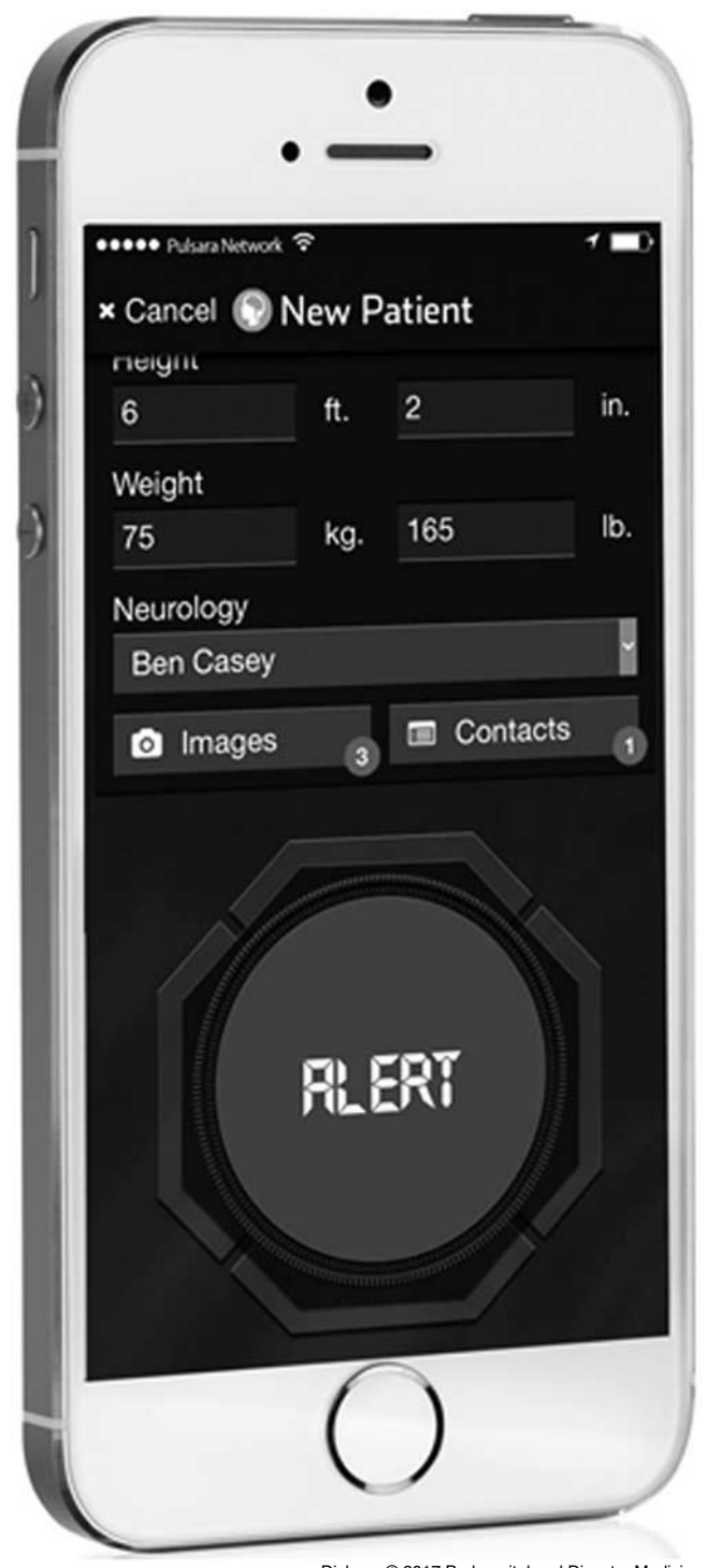
Dickson © 2017 Prehospital and Disaster Medicine Figure 1. Pulsara Stroke Alert.

The stroke coordinator used a standard abstraction form and was blinded to the study objectives. The study includes all available data from the stroke dashboard, 13 months before the initiation of Stop Stroke (February 1, 2012-March 4, 2013) and 12 months