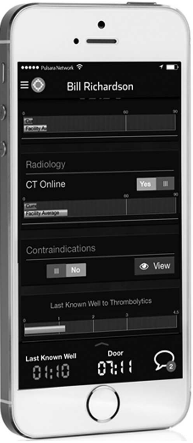
Dickson © 2017 Prehospital and Disaster Medicine Figure 4. Pulsara Stroke Universal Clock.

The number of cases meeting the benchmark of DTN < 60 minutes improved from 32% (11/34) to 82% (28/34), a 155% (P = .0001) relative improvement after Stop Stroke. The EMS was involved in 71% (24/34) of cases and there was pre-arrival notification in 66% (16/24) of cases.