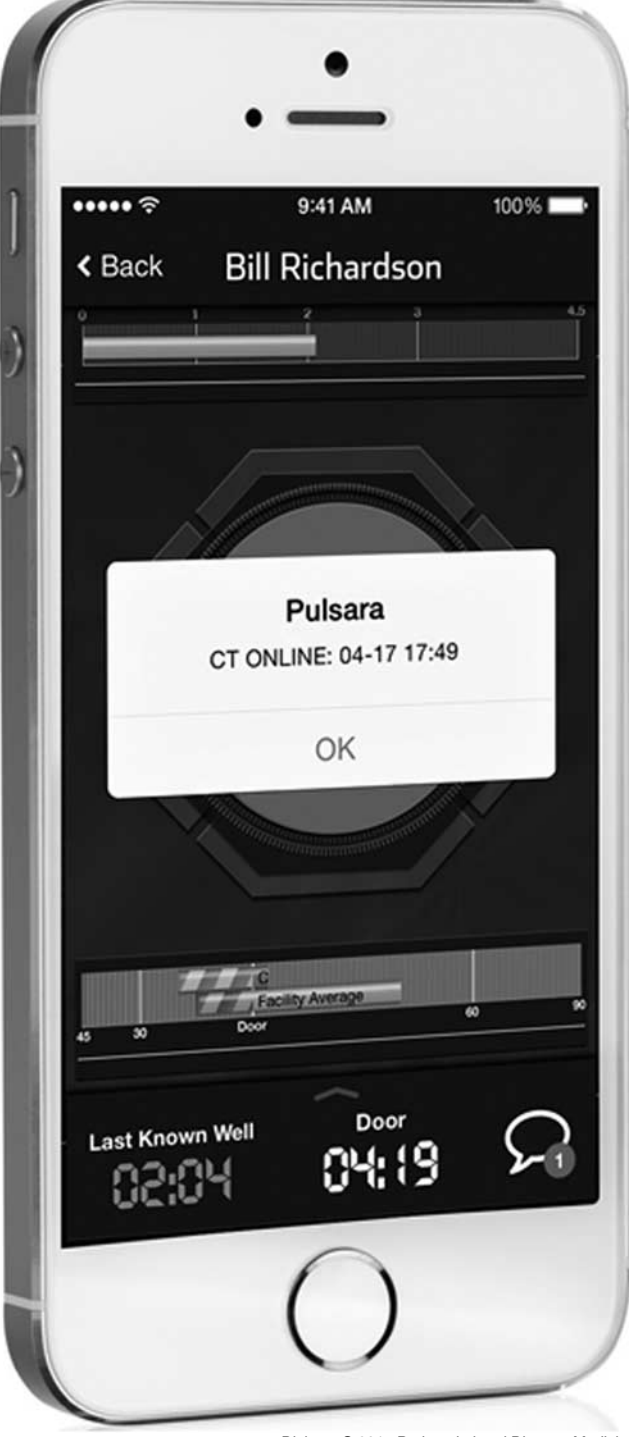
Dickson © 2017 Prehospital and Disaster Medicine Figure 3. Pulsara Stroke Universal Clock with Notification.