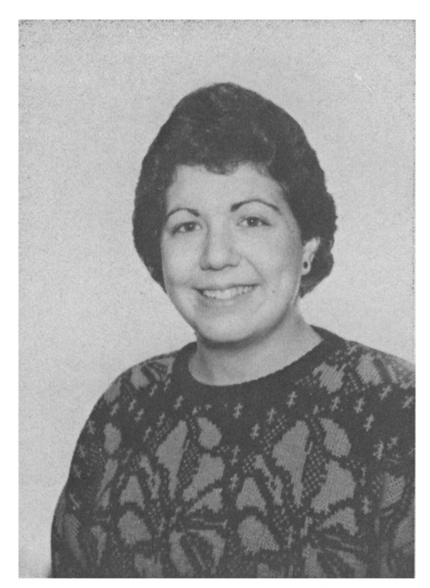
JO ELLYN MUILLO FOUNTAIN