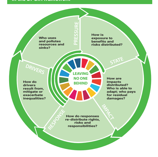
Figure 1.2: Integrating equity and economic questions in the DPSIR framework