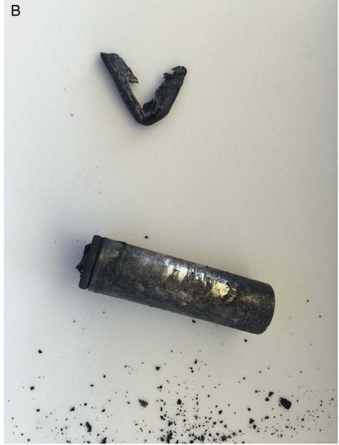
Figure 2. A) Anterior right thigh burn of the patient in Case II on the day of the burn injury. B) E-cigarette battery device and fragment of the casing removed from the thigh of the patient.