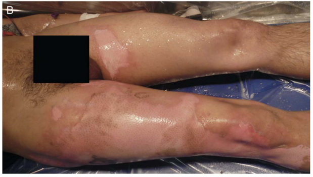
Figure 1. A) Right buttock and thigh burns of the patient in Case I. B) Bilateral anterior thigh burns in the patient in Case I, on the day of the burn injury.

admission. The patient's pain was adequately controlled with oral hydromorphone, ibuprofen, and acetaminophen, and supplemented by intravenous hydromorphone or fentanyl postoperatively and for dressing changes. Gabapentin was added as an analgesic adjunct postoperatively, to address neuropathic pain after skin grafts were harvested. His postoperative recovery was uneventful. He received outpatient physiotherapy and recovered full function within 2 months.