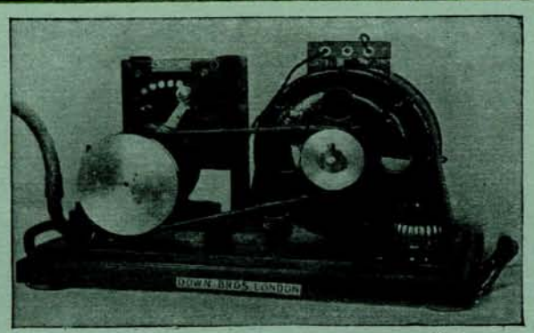
Rotary Blower with@Electric Motor.

Printed and Published Monthly by ADLARD & SON, Bartholomew Press, Bartholomew Close, London, E.C. (Temporary Address: 76, Newgate Street, E.C.)