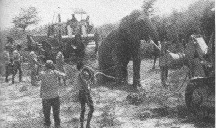
A LARGE BULL roped to two bulldozers getting up after reversal of the narcotic

STILL SLIGHTLY SEDATED the bull and bulldozers move off. Fully conscious a bull of this size would be impossible to control.