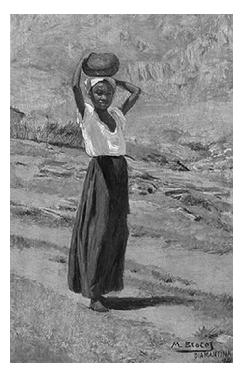
FIGURE 13.4 Modesto Brocos y Gómez, Crioula de Diamantina (also known as Mulatinha ), 1894. Oil on wood, 37 × 27.5 cm.

respect of a "painter of race." The prize-winning canvas of 1895, none-theless, demonstrated important innovations in the strategic choices of subject. Chiefly, Redenção elevated the local conditions of an interracial post-emancipation society to the center of artistic expression. The freshness of slave emancipation and the destruction of captivity were the subtext for a composition ostensibly about the "redemption" of the familial order mysteriously violated in Noah's tent.