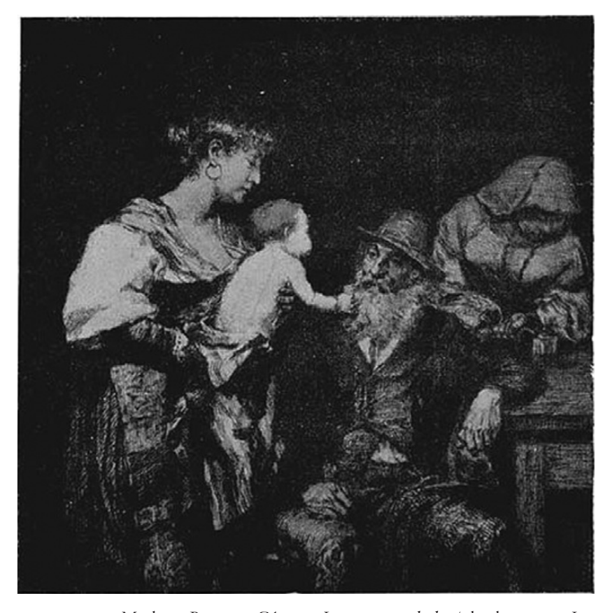
FIGURE 13.2 Modesto Brocos y Gómez, Las cuatro edades (also known as Las Estaciones ), 1888. Etching after oil on canvas, Almanaque Gallego (Buenos Aires) I (1898): 5.

developed an eye for themes of intergenerational dynamics. The prime example (see Figure 13.2) is Las cuatro edades (The Four Ages, 1888), also known as Las estaciones (The Seasons). Executed in Rome, two years prior to Brocos' relocation to Rio de Janeiro, Las cuatro edades shared with Redenção the composition of a humble setting where four rustic individuals of progressively increasing age, from the infant to the elderly, enjoy a moment of domestic intimacy. A similar four-figure composition of unknown dating, La familia (The Family, n.d.), featured a young child sitting in his finely dressed mother's lap reaching out to another adult female, perhaps a nursemaid, while a bearded male adult in a workman's apron looks on.