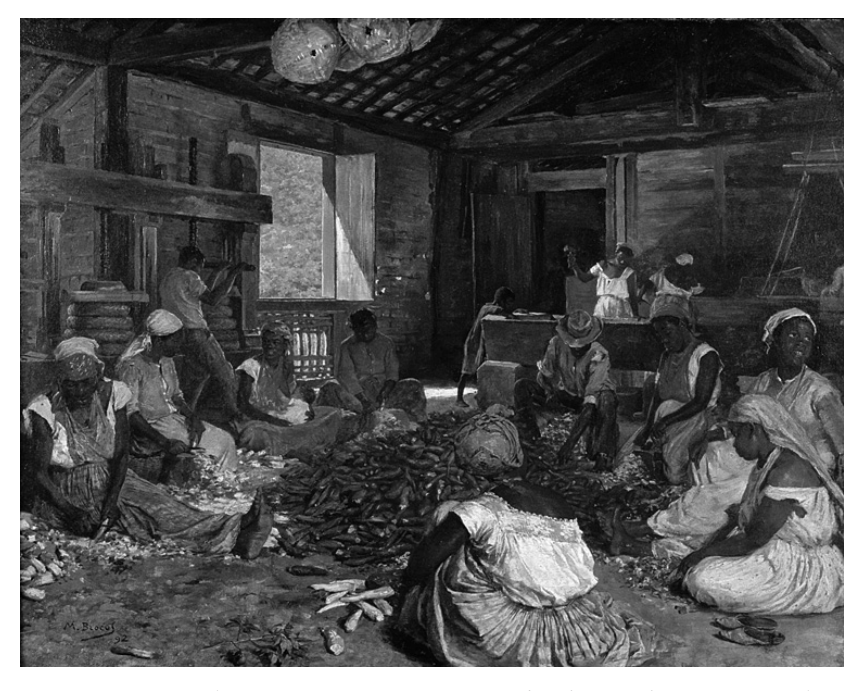
FIGURE 13.3 Modesto Brocos y Gómez, Engenho de Mandioca, 1892. Oil on canvas, 58.6 \times 75.8 cm, Museu Nacional de Belas Artes, Rio de Janeiro.

Engenho de Mandioca (Manioc Mill, 1892), Brocos' most significant work of intergenerational relations painted prior to Redenção, is in direct dialogue with the 1895 redemption allegory (see Figure 13.3). The 58.6 \times 75.8 cm canvas was first exhibited at a break-out show organized at the national fine arts school about two years after Brocos relocated from his native Galicia, Spain, to take up residence in the Brazilian capital. In a remarkable shift in Brocos' aesthetic attentions from the European peasantry to Afro-Brazilian folk people, Engenho presents an assembly of young and old Black females seated on an earthen floor in a large tiledroofed structure familiar to the Brazilian interior. In the background stand more adult women as well as an adult male and a boy of perhaps ten years. The main drama unfolds as these figures peel, grate, press, and cook cassava tubers to make manioc flour. At the work's first public exhibition, Brazilian poet and art critic Adelina Amelia Lopes Vieira favorably noted how the painting included a wide range of figures - the older woman exhausted by work, a proud mother and her nursing infant, a smiling