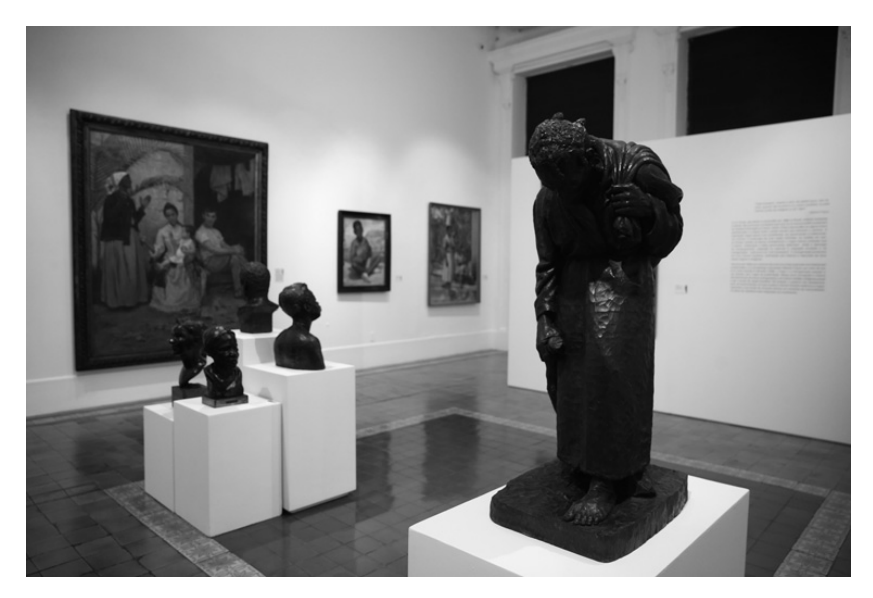
FIGURE 13.7 Tomaz Silva/Agência Brasil, "Das Galés às Galerias," 2018.

In a reappraisal of Redenção that considers the real alongside the imaginary, the dramatis personae of the story remain largely the same as those seen by the apologists for whitening, but the dynamism of the view shifts from the right of the canvas to the left, from the figure of the largely passive white male toward the elderly Black woman – a former slave, possibly an African. Her posture may have less to do with the awestruck wonder for the birth of a "white" grandchild purportedly fathered by the immigrant son-in-law and more to do with the culmination of a long process of securing the freedom of herself, her offspring, and her race. As we look yet again at the canvas, the dark specter of racial sciences and a whitened future remain, but those "tribulations of liberty" and the alegria of slave emancipation that Brocos came to know intimately animate our interest in this enigmatic allegory of history-telling and race-making in Brazil.