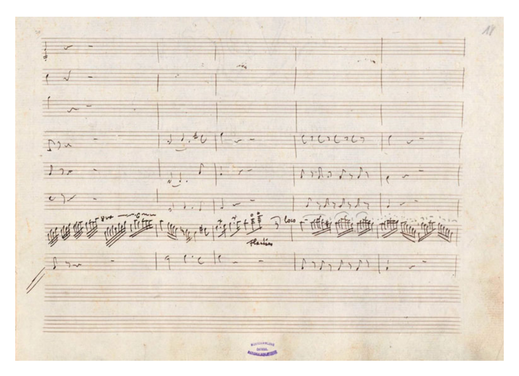
Figure 6 (Colour online) Haydn's autograph of the D major cello concerto, fol. 18r (first movement, bars 173–177). Haydn's marking 'Flautino' may be seen in the third bar beneath two notes marked to be played as harmonics. Articulation marks in the solo part in the subsequent two bars are later additions to the score. These appear in André's edition of c 1804.

a performer, his ability to hide a phenomenal technique such that difficult music sounded relaxed, matches well the unparalleled sound world of Haydn's concerto.