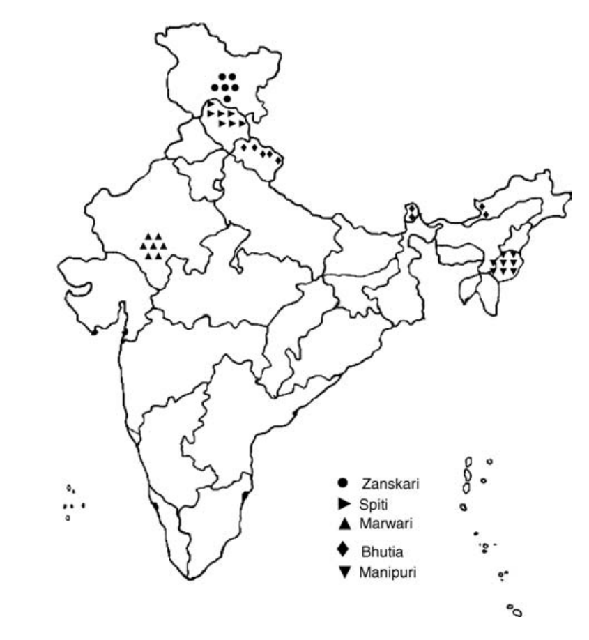
Figure 1 The areas of distribution of five Indian horse breeds.

between 3000 to 5000 m altitude. They are mainly used for transportation and agricultural operations. The Zanskari breed is at the verge of extinction as only a few hundred horses of this breed exist now (Yadav et al., 2001). The Spiti and Bhutia ponies with similar characteristics are also found in same kind of agro-climatic conditions. Though, the Spiti horses are distributed in Lahaul/Spiti, Kinnour and Pangi areas of Himachal Pradesh, they are mainly bred in a few hamlets of Pin valley using traditional selection practices for identifying males for breeding. There present population is estimated to be less than 3000 (Katoch et al., 2004; Behl et al., 2005). The Bhutia ponies with their estimated population of less than 5000 are distributed in the Middle/Eastern Himalayas all along the Tibet border reared by the Bhutia tribe (Bhat et al., 1981; Yadav et al., 2001). The Manipuri ponies with a present population of 2327, are found in Manipur province in north-east India. The Manipuri ponies are referred to as original polo ponies. They are evolved from ponies brought from Tibet around 1200 years ago (Anonymous, 2006). All these Indian horse breeds have been listed as threatened breeds.