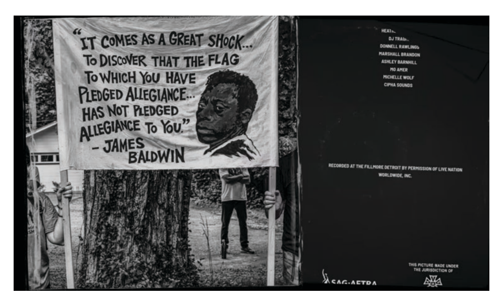
Figure 6: One of several images of protest signs in the closing credits to The Closer.

they condemn him, or the live audience who license speech that is not primarily addressed to them? Perhaps I am also one of the dupes for seeing something worthy of sustained attention in Chappelle's bad faith. But I can't escape the feeling that The Closer 's infelicities enact something essential about public speech at the present time.