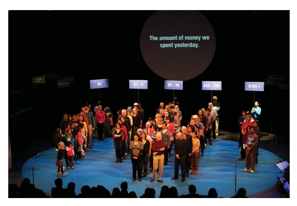
Fig. 4 (Colour online) Percentiles form lines categorizing themselves in terms of 'amount of money spent yesterday'.