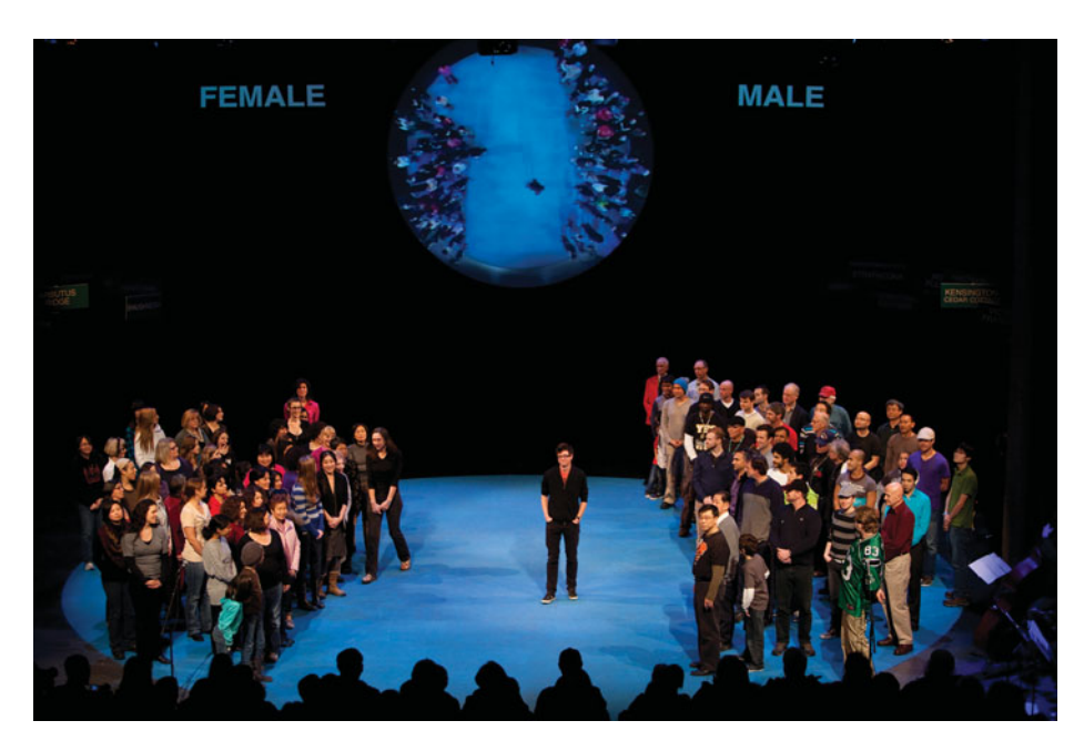
FIG. 2 (Colour online) The 100% Vancouver participants divide the stage between 'female' and 'male'. A transgendered percentile bravely stakes the middle ground between gender divides.

King musical in any major city around the world. That is, it is reproducible (same set, same casting procedures), it claims to represent everyone and it claims to be (for) everyone (the statistical portrait onstage captures and expresses the needs and hopes of the local public offstage). However, the marked difference between one show and the next is that an Athenian cannot easily stand in for a Vancouverite. City after city, 100% shows us what cannot be duplicated: the lived experiences of residents, the histories of place, the local cultures and the material contingencies that are specific to each urban centre.