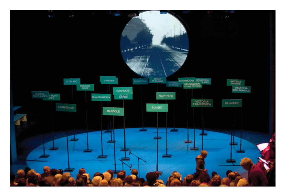
Fig. 7 (Colour online) The signs onstage represent the different neighbourhoods in Vancouver. First percentile Patti Wotherspoon tells the audiences, 'Three neighborhoods are not represented - South Cambie, Oakridge and Shaghnessey. We didn't find people with the right criteria, at the right time, in those neighbourhoods.'

extreme are site-specific art and theatre, which have traditionally sought to oppose the genericity of consumer culture through 'geographical and cultural specificity'. 40 Rebellato argues that this opposition to the global (often simply on the grounds that it is not local) limits site-specificity's fight against globalization to the valorization of the particular and local. Provocatively, the artistic antidote Rebellato offers to globalization is postdramatic theatre because it situates the local and the global as dialectical rather than oppositional modalities; this flexibility offers the best possible resistance to global capital.