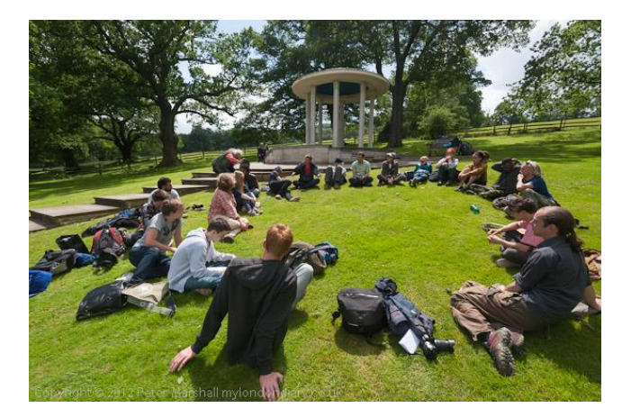
Fig. 1. "Magna": Diggers and others near Runnymede Eco-Village, reproduced with the permission of Diggers2012<sup>1</sup>

"Forget not, after all these years,The charter signed at Runnymede."— Rudyard Kipling, "The Reeds at Runnymede" (1912)