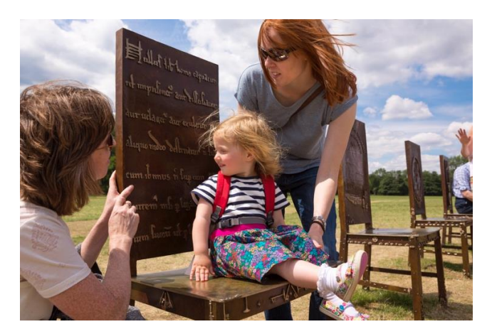
Fig. 3. Photograph by Max McClure of a chair from Hew Locke's The Jurors , reproduced courtesy of Situations<sup>77</sup>

actually relate directly to courtroom trials, and, in each case, the evidence regarding the role of juries in assuring a just outcome is decidedly mixed. If it is true that Nelson Mandela was condemned to Robben Island without the benefit of a jury, that was certainly not the case with Oscar Wilde's imprisonment in Reading Gaol.<sup>75</sup> In the 1783 trials concerning the death of 133 African slaves thrown off the Zong by its crew, it was the jury who approved the owners' claim for compensation for the loss of "cargo," and the Lord Chief Justice who ordered the case to retrial.<sup>76</sup> Neither the images nor supporting texts convey anything of the problematic issues here. Meanwhile, the title, disposition, site and occasion of the work all associate the idea of jury trial with the rule of law in the struggle for freedom.