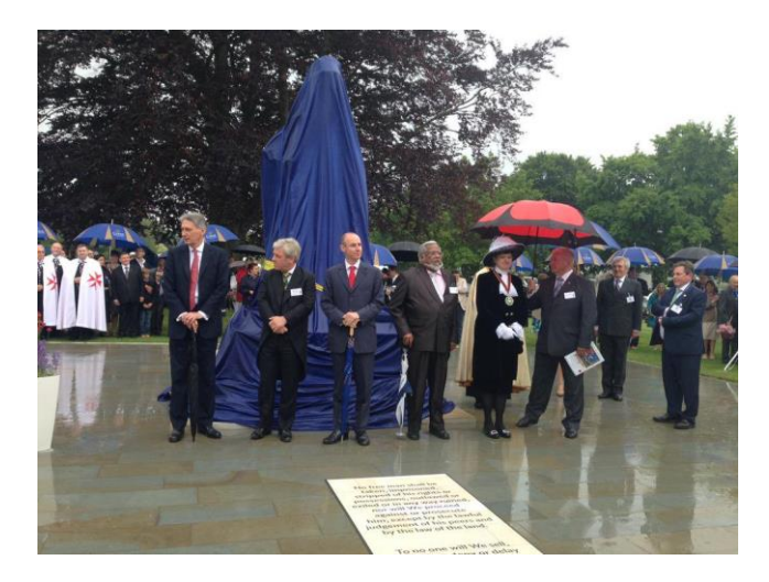
Fig. 4. The inauguration of James Butler's statue to Queen Elizabeth II at Runnymede on June 14, 2015, reproduced by permission of Mirrorpix/Eleanor Davis.<sup>83</sup>

does not guarantee justice any more than civil systems that function largely without them are by that token necessarily less just in their outcomes.