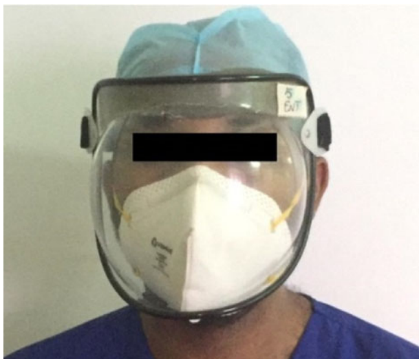
Fig. 1. The N95 mask and face shield used by the audiologist during speech audiometry testing with personal protective equipment.

audiometer. Pure tone air conduction and bone conduction thresholds were obtained for frequencies of 250–4000 Hz. Thresholds up to 25 dB across the frequencies 250–2000 Hz were considered normal. The pure tone average was calculated using thresholds at 500, 1000 and 2000 Hz, and was also used to check the validity of the speech audiometry results. This was achieved by checking there was not more than 12 dB discrepancy between the pure tone thresholds and the speech reception threshold.