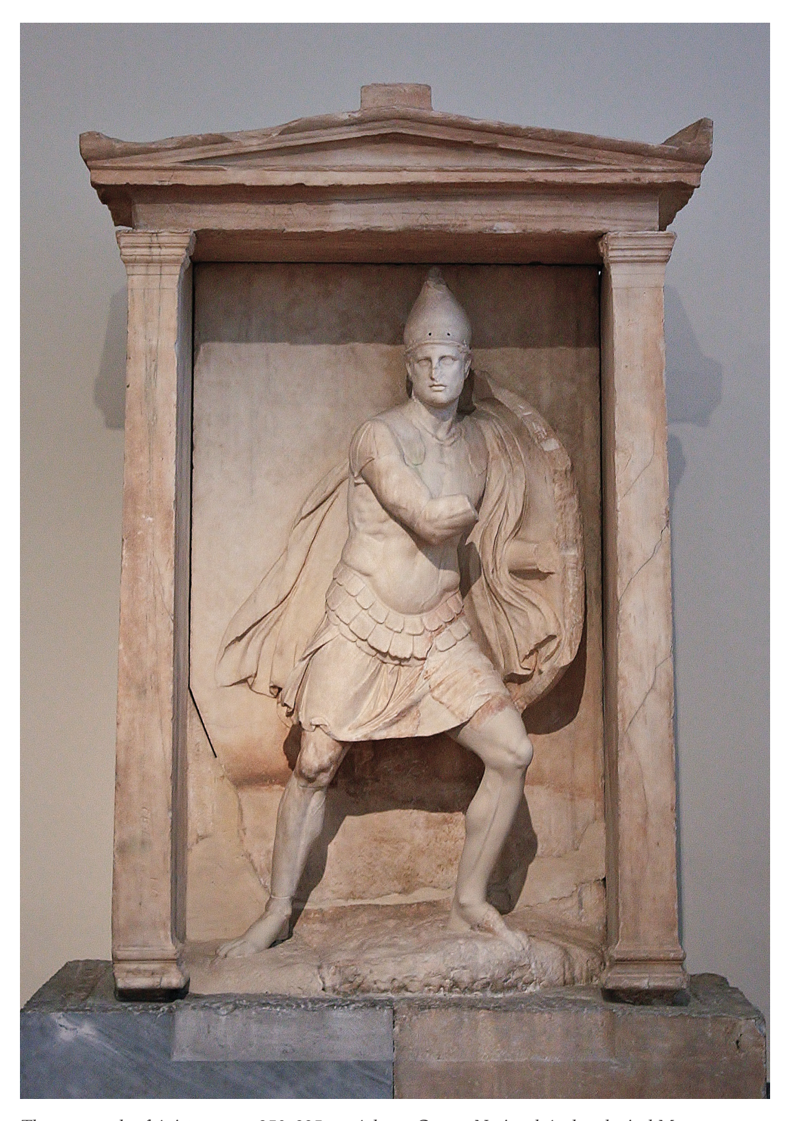
The grave stele of Aristonautes, 350-325\, BC, Athens, Greece, National Archaeological Museum (see p. 80).