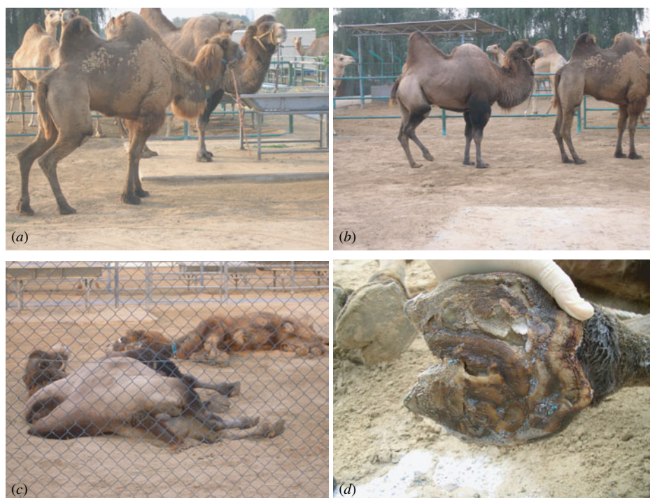
Fig. 2. Foot-and-mouth disease virus (FMDV) in Bactrian camels. Lameness of hind feet in Bactrian camels B2 ( a ) and B3 ( b ); depression ( c ) and severe lesions caused by FMDV type A SAU 22/92 infection of the hind foot pad of Bactrian camel B2 on day 9 p.i ( d ) (no lesions observed on the front feet left corner of the picture).

None of the inoculated and contact dromedaries as well as the contact sheep showed any clinical signs of FMD or developed fever. No infectious FMDV or FMDV RNA was detectable in the sera, probang, or mouth-swab samples from the eight inoculated, five contact dromedaries or from the four contact sheep. None of these camels and contact sheep developed viraemia or developed any antibodies to FMDV as tested by VNT and SPBE ELISA up to 28 days p.i.