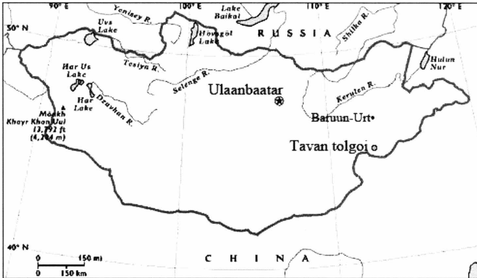
Figure 1 Geographical location of the Tavan Tolgoi site in Mongolia