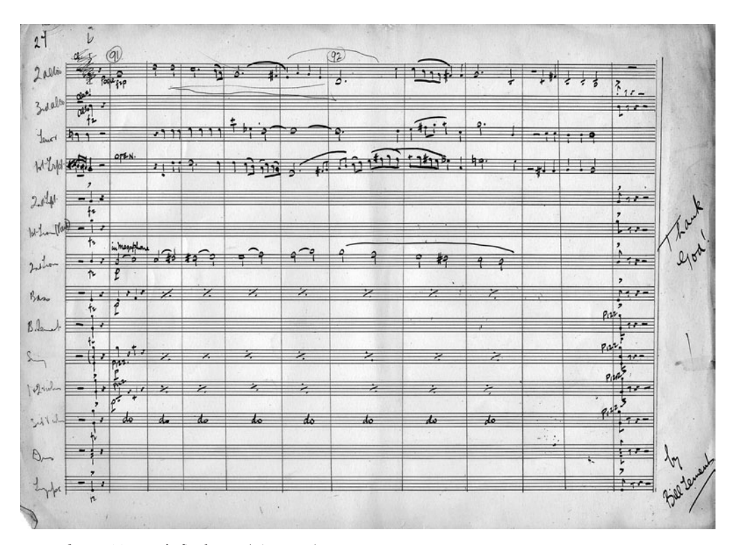
Example 4c Ternent's final page (Figs 91–2).

MASSENET: My dear Saint-Saëns, is it yours, this delightful music here? BIZET: Gentlemen, they profane the temple . . . It's sacrilege!<sup>66</sup>