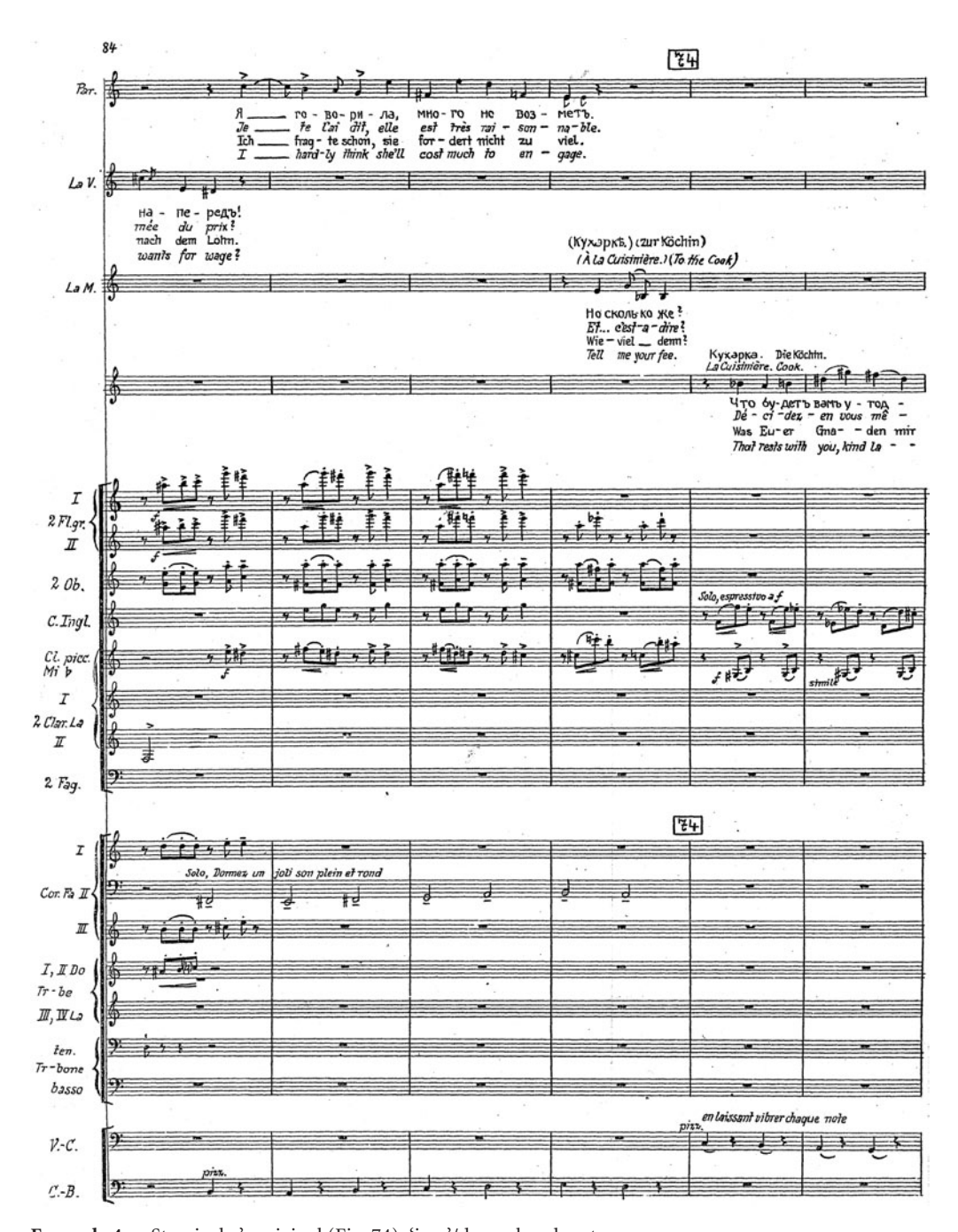
Example 4a Stravinsky's original (Fig. 74): 'jazz'/dance-band gestures.

In this way Stravinsky's Mavra , a work that already embodied a kind of faux sentimentality, was presented in all seriousness by an anxious dance band, whose audience associated Hylton with levity and was therefore bemused and bored. Ironically, although Hylton's