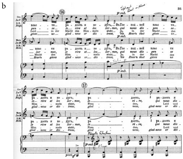
Example 3 'Jazz'/dance-band gestures: (a) Ternent's arrangement (Fig. 54). (b) Ternent's annotations on Stravinsky's piano reduction (Fig. 56).

Also richly suggestive are Ternent's dark-blue ink and pencil annotations upon the published vocal score received from Stravinsky; see Example 3b. <sup>60</sup> The frequent instrumental