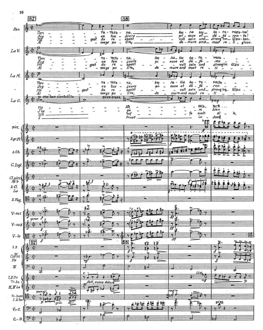
Example 4b Stravinsky's original (Figs 87–8): 'jazz'/dance-band gestures.

Mavra was no longer opera, his band's much publicized infiltration of jazz into the sacrosanct Opéra had taken the form of spoof opera – an aspect of the event that was parodied the following month by Clément Vautel in the satirical publication Cyrano: