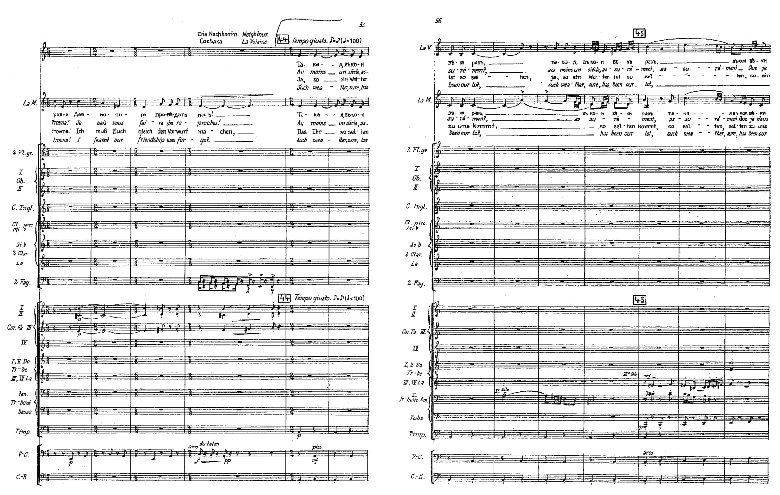
Example 1b Stravinsky, Mavra, full score, Figs 44-5. © 1925 by Hawkes and Son (London) Ltd. Reproduced by permission of Boosey & Hawkes Publishers Ltd.