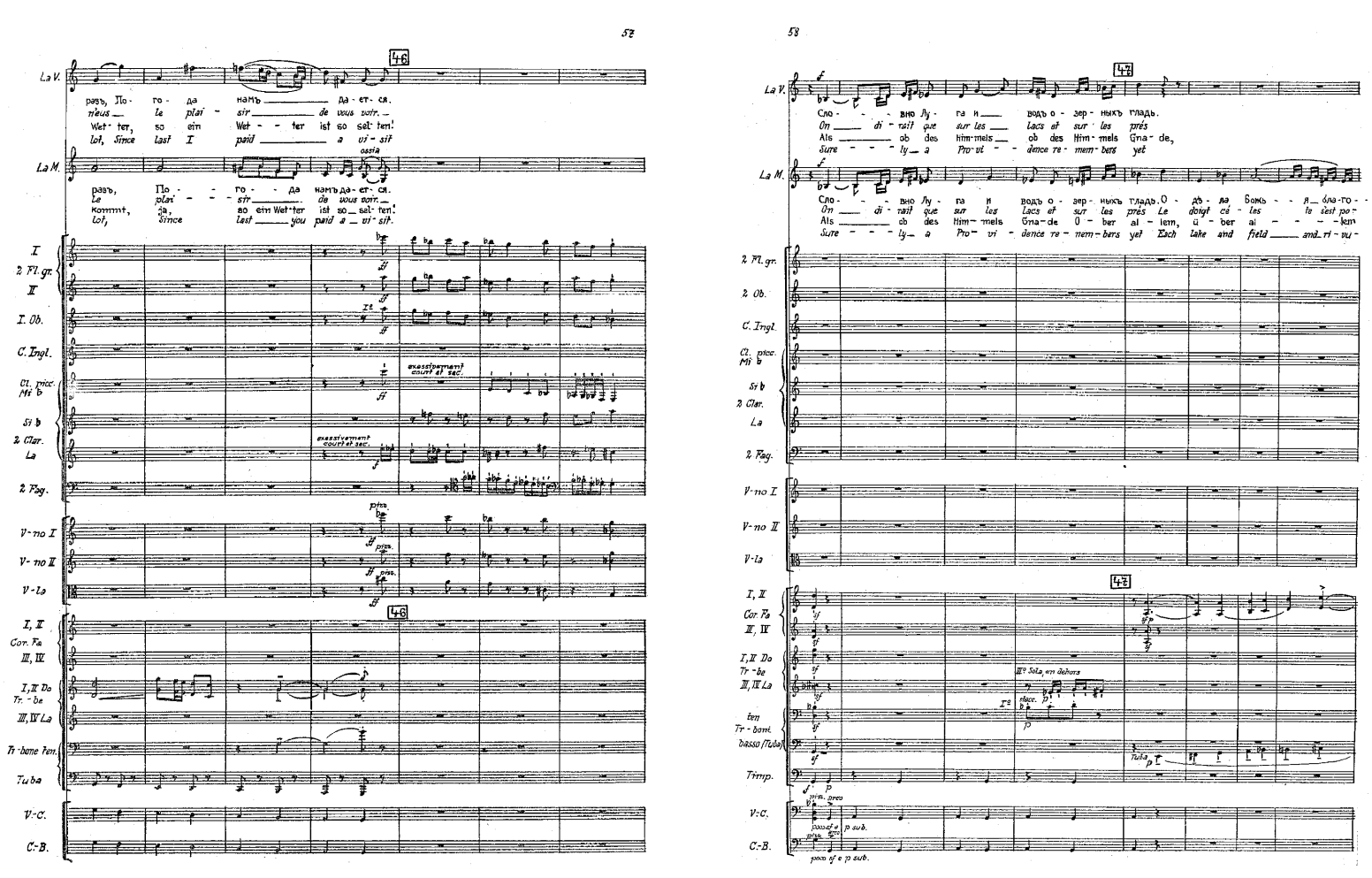
Example 2b Stravinsky, Mavra, full score, Figs 46-7. © 1925 by Hawkes and Son (London) Ltd. Reproduced by permission of Boosey & Hawkes Publishers Ltd.